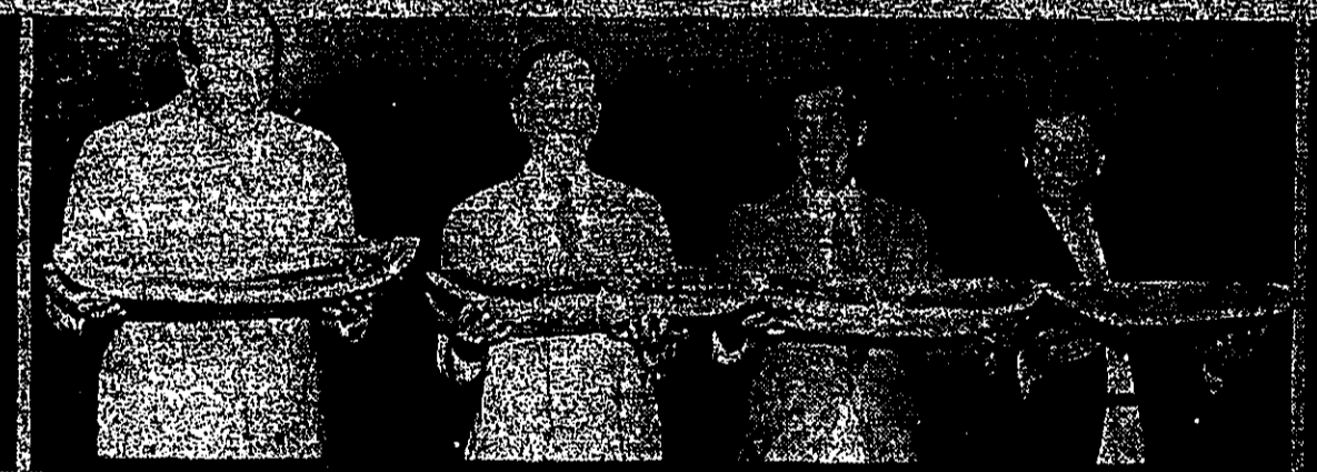
Secretary of Commerce... (Caption describing the cabinet members)