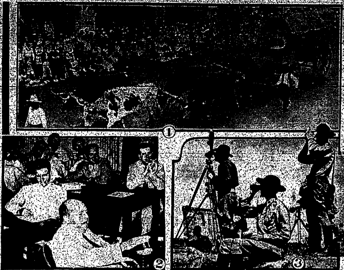
—Hatched early in the morning... (Caption describing the top photo)

Army Begins Greatest War Games Since '18... 35,000 Troops Take Part in Maneuvers