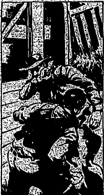
He Could See Rebotock's Eyes Flashing Green.

Two men had taken the seat directly behind her. Jane resumed her reading until the conversation between the two men became so interesting that she stopped reading. She was attracted by catching the name of Bill Denton.