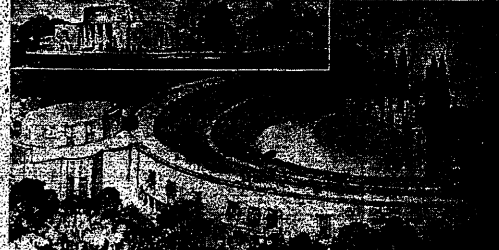
NEW YORK (Special)—The State of New York, it is disclosed in architectural drawings made public...