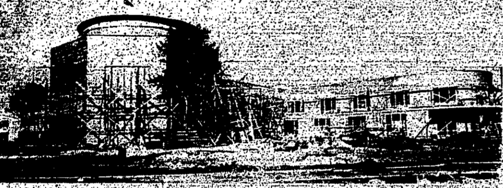
NEW YORK (Special)—The State Capitol building, shown as a reconstruction building of the New York State Capitol...