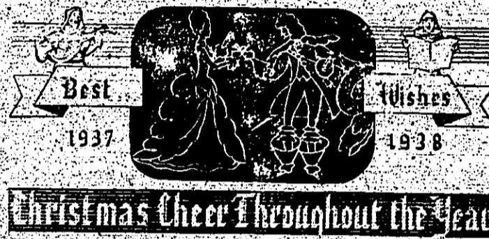
Christmas Cheer Throughout the Year