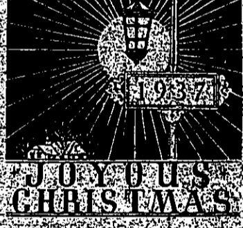
H & H CASH SYSTEM