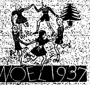
MAGNOLIA DRY CLEANERS