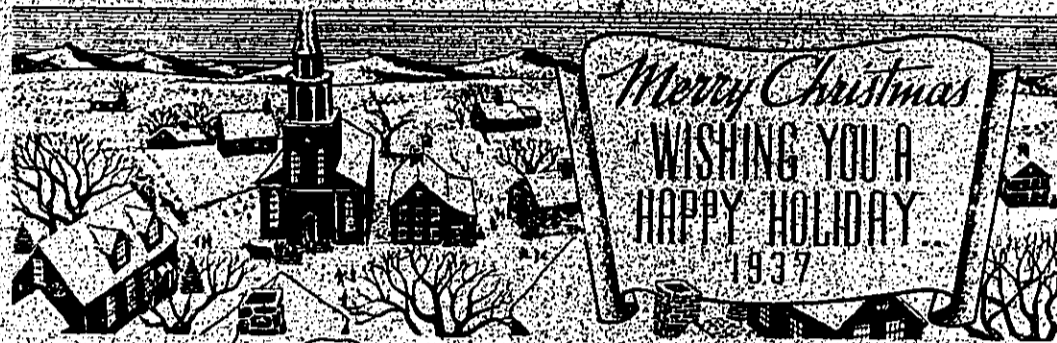
J. WOOD FAIN AND FAMILY