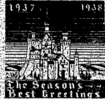
The Seasons Best Greetings