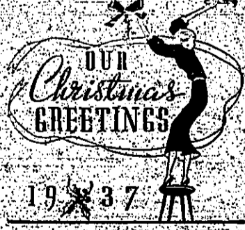
WILLIAMS ELECTRIC SHOP