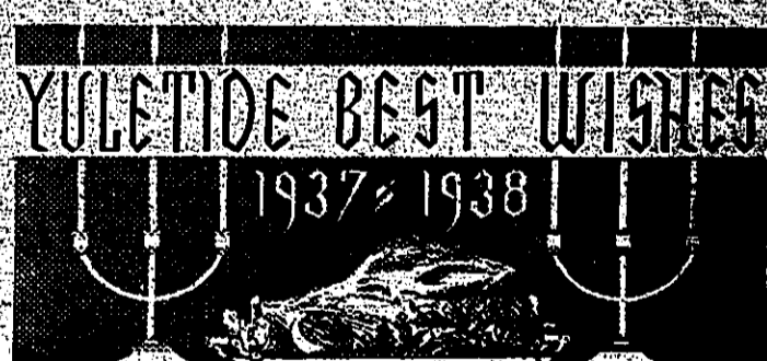
PALACE BARBER SHOP