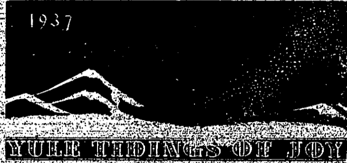
YULE TIDINGS OF JOY