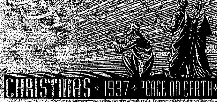
J. H. FAIN STORE, DOUCETTE