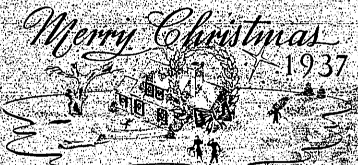
SUTTON FAIN CHEVROLET CO