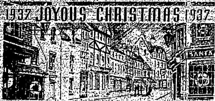
VETERANS OF FOREIGN WARS