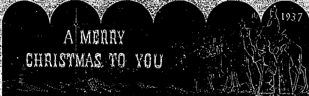
FIRST STATE BANK, COLMESNEIL