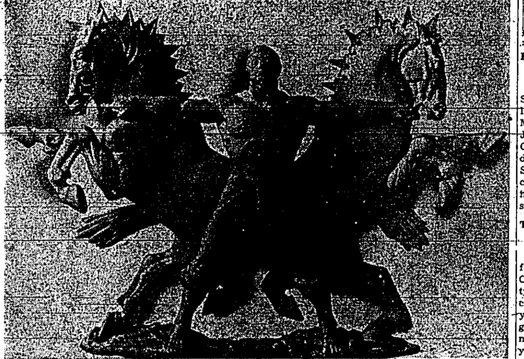
NEW YORK—Symbolizing mankind's control of nature, this large statue will have a prominent place on the $90,000,000 Central Mall of the New York World's Fair 1939.