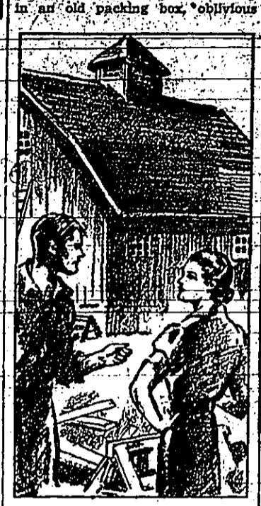
It was Leonora who suggested moving in.

"I would, retorted Leonora. "He's a perfect example of what the world calls a scholar and a gentleman. But he'll never know how superbly that quotation fits our case. Father bid me open back in the days when he was fighting the thought of our marriage, that to survive, a house must be built upon a rock." "Safe upon the solid rock the ugly houses stand; Come and see my shining palace built upon the sand!"