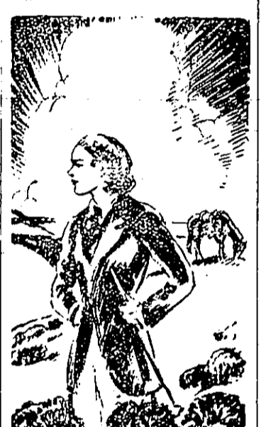
It was the note of the Basque bell.