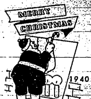
Parson's Service Station