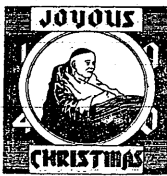
Birdwell Variety Store