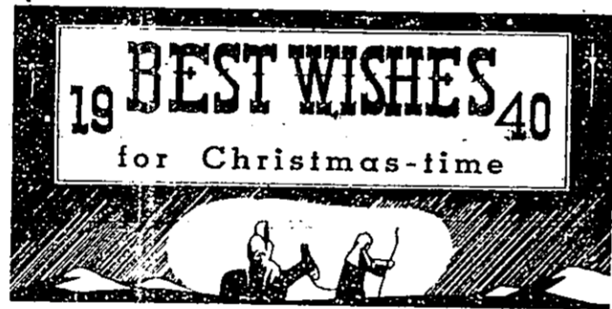
GILCHRIST MERC. CO., COLMESNEIL, TEXAS