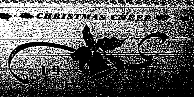
WILLIAMS & CLAY, BUTANE GAS CO.