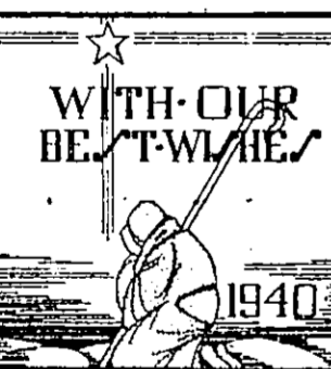
BAKER MOTOR CO.