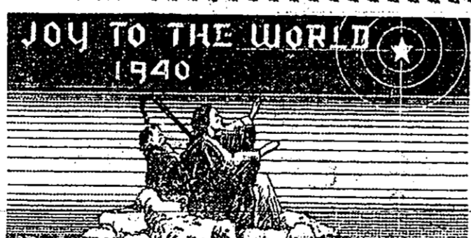
MILLS FIRESTONE TIRE SHOP