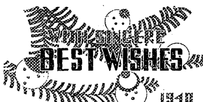
OAKLEY - METCALF