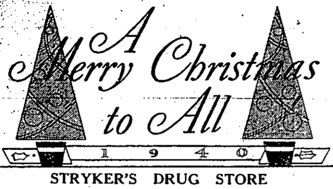
STRYKER'S DRUG STORE