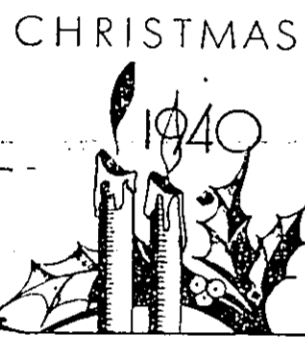
Wisembaker Barber Shop