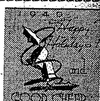
CITIZENS STATE BANK