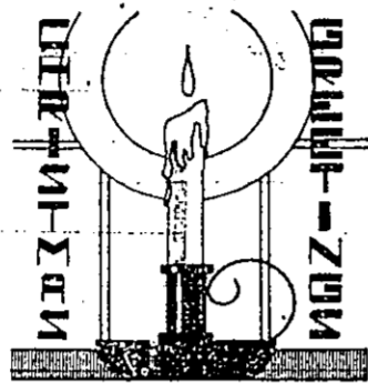
Glenns Variety Store