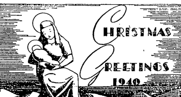
TOWNSEND MOTOR CO.