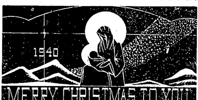
FIRST STATE BANK, COLMESNEIL