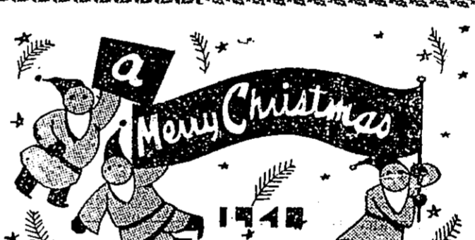
SUTTON & FAIN CHEVROLET CO.