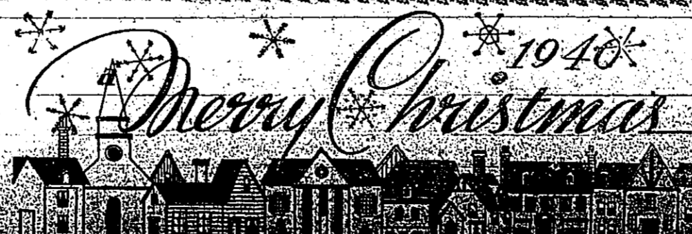
WILLIAMS & CLAY, BUTANE GAS CO.