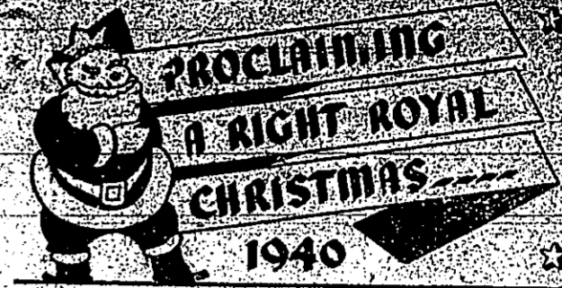
YELLOW FRONT STORE — EZRA EAVES