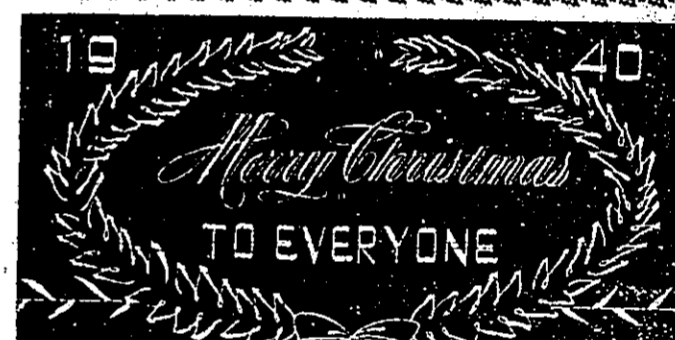
WILLIAMS & CLAY — BUTANE GAS CO.