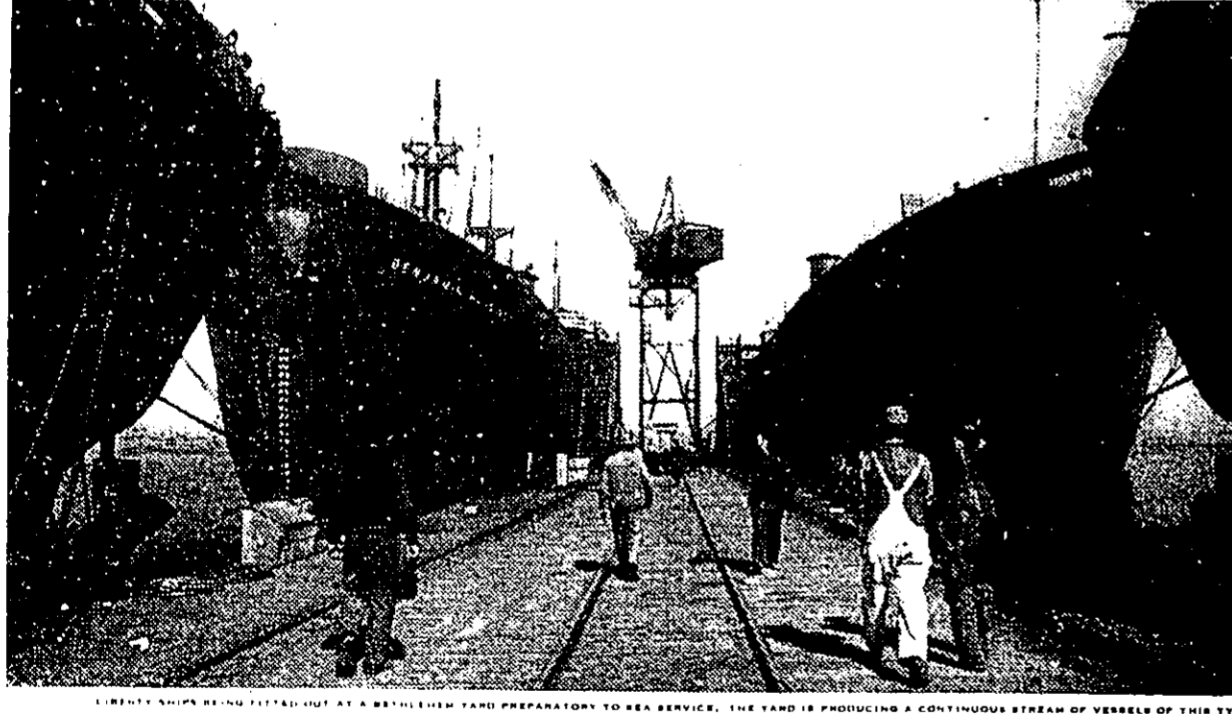
Bethlehem ship production this year will represent the greatest all-around shipbuilding output by any company in the history of the country.

Speed, speed and more speed—the constant objective; and always speed with quality, for a jerry-built ship is virtually useless in the grim tasks of maritime war. The first Liberty ship which recently discharged supplies at a Red Sea port was built in a yard that was virtually nonexistent a year ago. A battleship will be delivered 14 months ahead of schedule. Cargo ships are being built in less than one-half the time required in the first World War. Comparable speeding up has been achieved on other types of ships and the schedule is being constantly stepped-up. Expanding old yards, building new ones, tripling employment in a year's time, training thousands of new men, putting every effective facility to use, adopting pre-assembly and mass production methods—all these spell tonnage and more tonnage, a steadily-mounting output of ships from Bethlehem yards. All hands are doing their utmost for Victory, working to achieve the maximum for the U. S. Navy and the U. S. Maritime Commission, so that the "bridge of ships" shall be maintained and steadily enlarged.