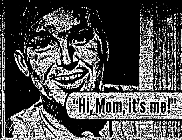
"Hi, Mom, it's me!"