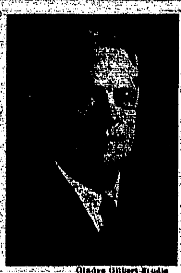
Portrait of a man, likely a church official.

The church has a long and distinguished history, and its members are proud of their heritage. The annual meeting is a time for the church to come together and discuss the work of the church in the world. It is a time for the church to evaluate its progress and to plan for the future. The meeting was held in a spirit of unity and cooperation, and it was a great success. The church is looking forward to the future with confidence and hope.