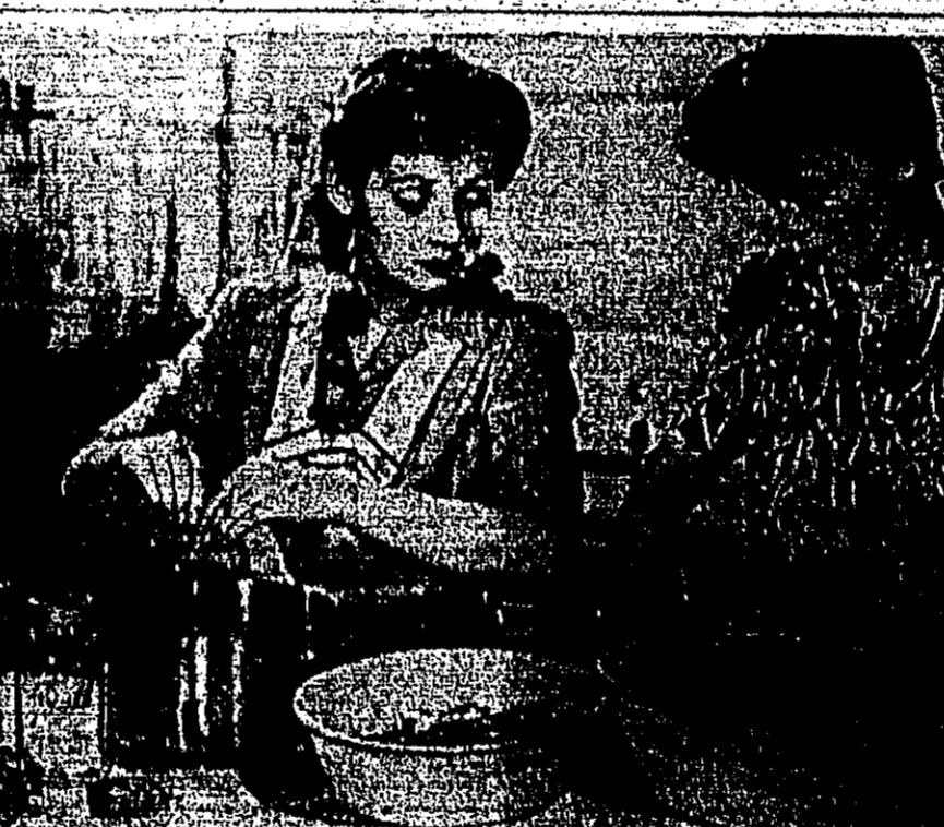
From Good Care, Wash Day.

Victory by the home-making front is easily won by those who understand the ruthless nature of the enemies—yeasts, molds, and bacteria—that attack the parts of food to cause spoilage. Usually they go into the air on the food, they are on the surface of broken plates in the sink, they are on the surface of the sink, they are on the surface of the sink. They are on the surface of the sink. They are on the surface of the sink.