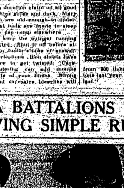
From Good Care, Wash Day.

It is not the quality of the bedding that makes it last longer, but the way it is cared for. Good care makes bedding last longer. It is not the quality of the bedding that makes it last longer, but the way it is cared for. Good care makes bedding last longer.