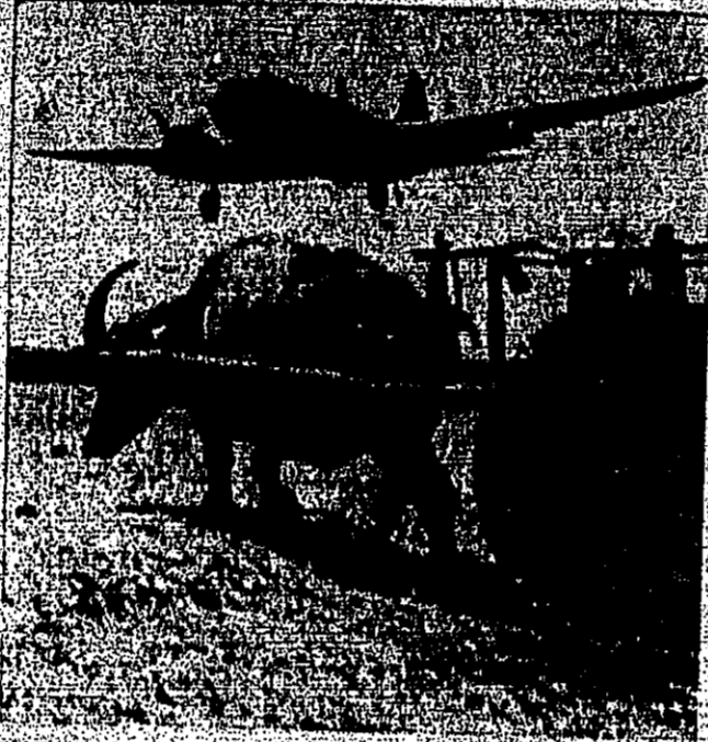
THE OLD AND THE NEW —Contrasts in China offer another example of progress as men cheer slowly rolling along while modern war plane comes in for landing on newly constructed runway.