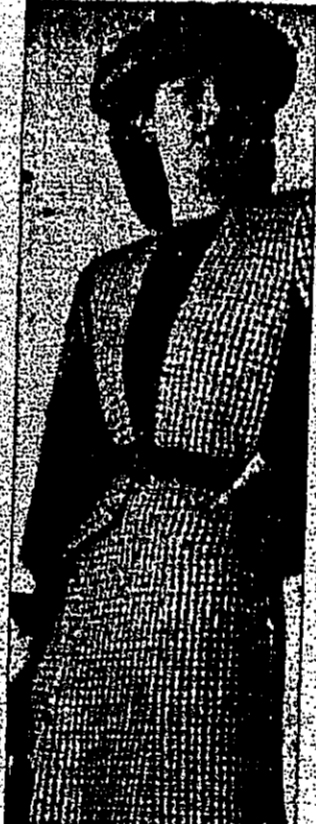
DOT A GARDEN —Blind for 30 years, this lively couple, out of blue, and brown sword features, walk for front of caps, while back flings low and wide. How-necked blouse is of brown rayon crepe matching lining of caps. Mushroom hat (top ensemble created by Chicago Fashion Institute).