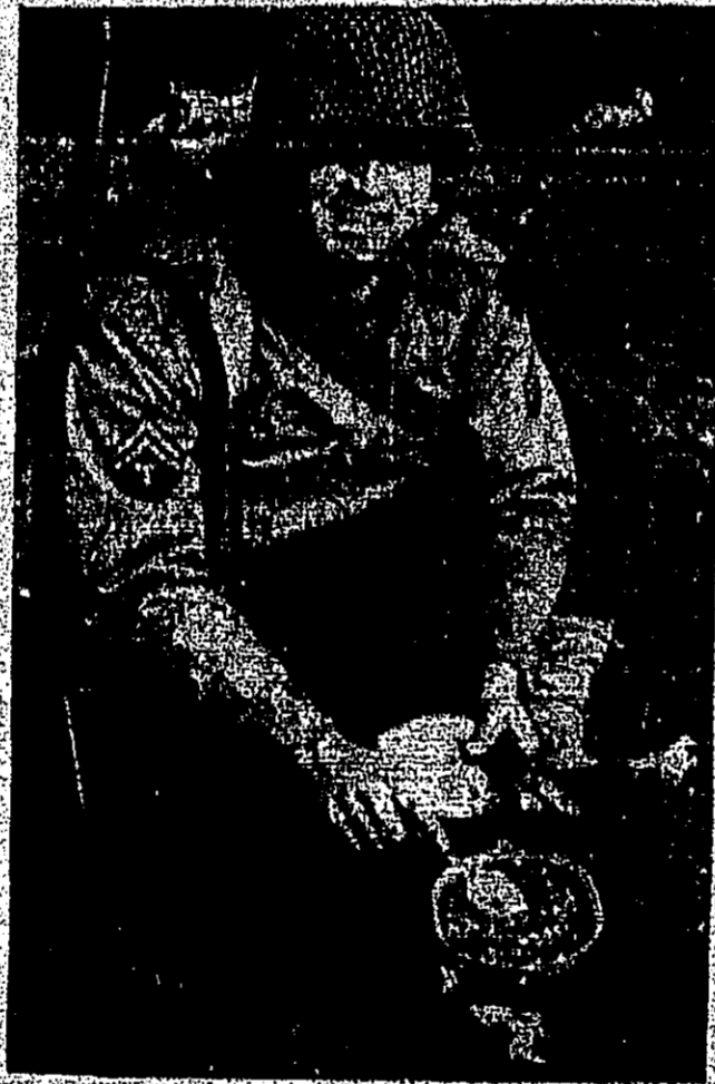
CAPSULE STOVE —G.I.'s are thoroughly familiar with capsule foods, and now they have a capsule stove on which to cook hot meals on the field. The capsule can be carried in the pocket, and will burn for 30 minutes. All the soldier has to do is dig a hole, drop in the tablet and light it up. Then he can cook rations or anything that he might desire.