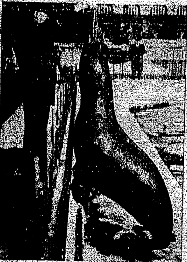
YUM, WUM —No matter how much fun gliding Mr. Seal gets out of swimming among flocks of fish in his Central Park pool in New York, he's never too busy to take time out for food as Park Department employee fishes out luscious fish.