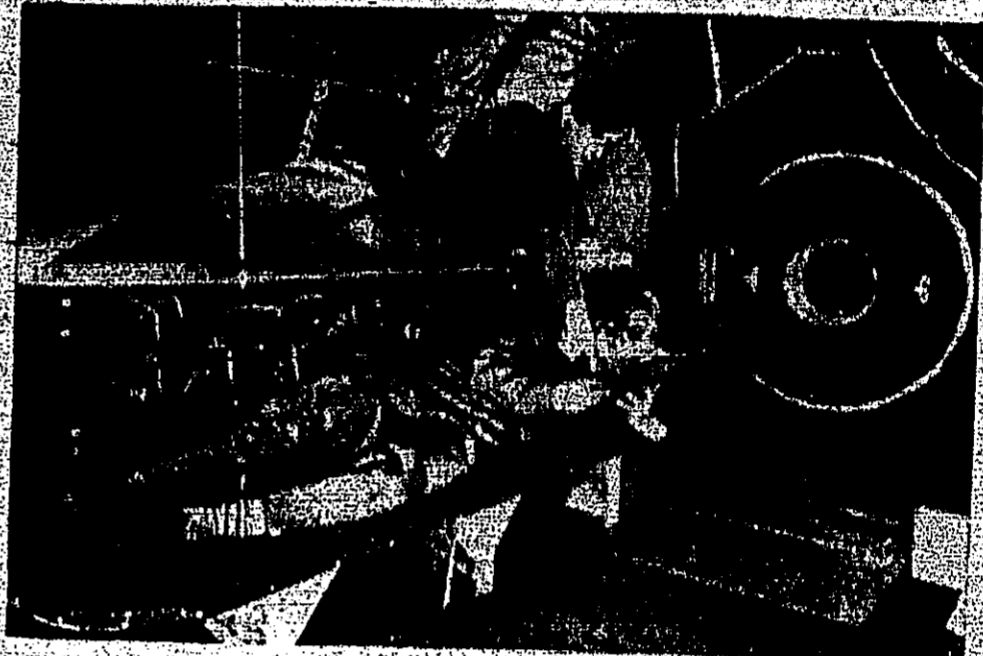
COMPY, BUI —Inside of a mighty B-29 Superfortress shows pressurized section crew compartment. Just aft gunners section, where bunks are provided for rest and relaxation of relief crews on the bomber's long missions. Some of these bunks cover round-trip distances of from 3,000 to 4,000 miles. Men shown are wearing parachutes, ready for any emergency.