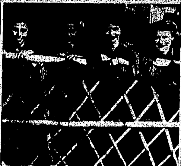
Three American Red Cross girls smiling from behind a lattice fence in a field hospital.