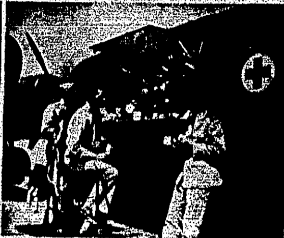
Assistance in the care of wounded soldiers is a major task of Red Cross workers in military hospitals.