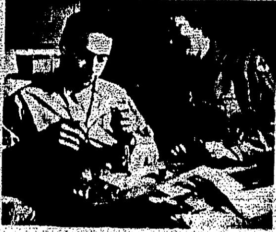
Training Gordon and other women in the skills in job of Red Cross workers in military hospitals last year. This woman learns to make food and care beds.