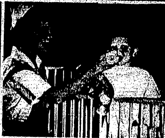
Assistance in the care of wounded soldiers is a major task of Red Cross workers in military hospitals.