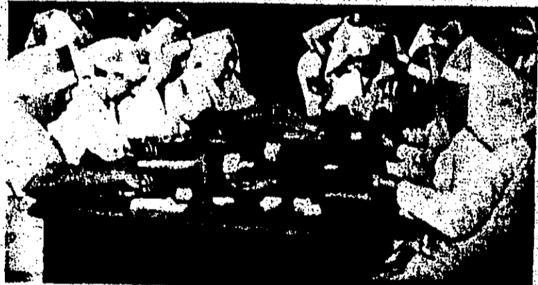
Surgical dressings for wounded - 775,000,000 in 1944 - are made by Red Cross production workers in thousands of communities on home front.