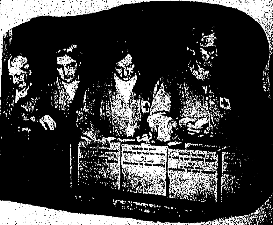
Red Cross food parcels for Americans in enemy prison camps are packed by patriotic women working long hours daily in four modern packing centers. 10,000,000 were packed by production line methods last year!