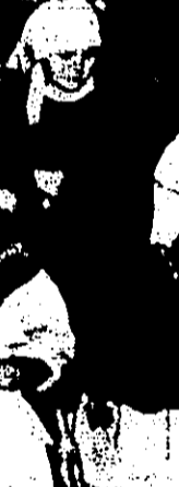
A smile of etern- refugee in Egy- clothes provid-