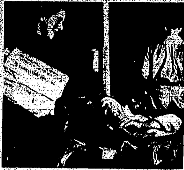
A cheery smile from a Red Cross nurse as she hands a cigarette to a soldier who has just been treated for pain in a field evacuation hospital in France.