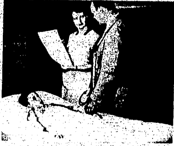
Red Cross Home Nursing courses taken by American housewives help to free professional nurses for the armed forces. This mother has kept a bed chart which she shows to the family doctor.