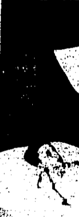
Red Cross-Hom- can housewife for the armed chart which she