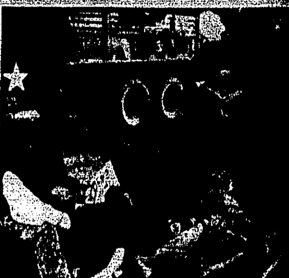
A Red Cross nurse holding a large American flag in a field hospital.