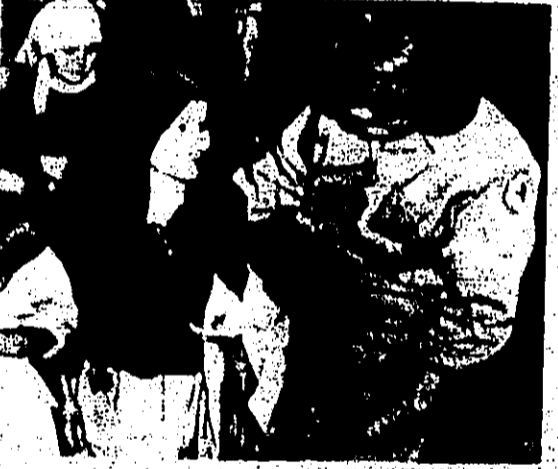
A smile of eternal gratitude! Ripped Yugoslav girl refugee in Egypt thanks Red Cross worker for clothes provided through American gifts.