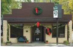
Tyler County Chamber Visitor Center