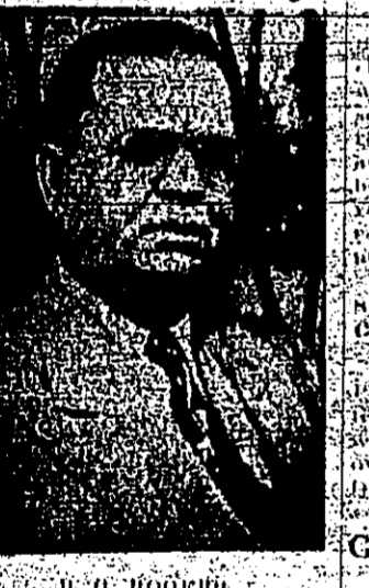
Portrait of a man, likely related to the political news.

Biographical information and campaign details for Allan Shivers.