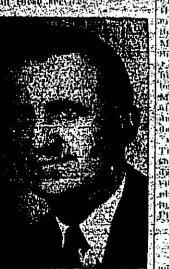
Portrait of a man, likely related to the political news.

Additional political news and announcements.