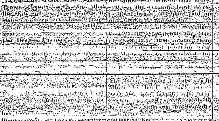
THE BAPPLES By Mahoney