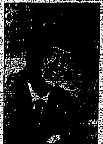
MAN OF THE YEAR