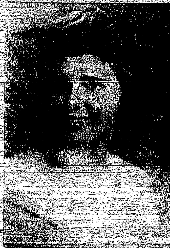
Wife of the late...

CARNATION EVAPORATED MILK $1 7 TALL CANS