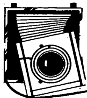
"Home of the Seeing-Eye Camera"

THE PINYWOODS PRESS P. O. Box 837 Woodville, Texas