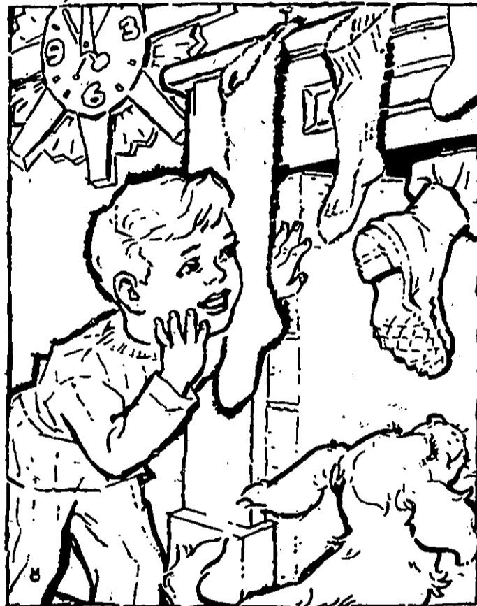
Oh look, look! Who can it be? Santa's coming with gifts for me.