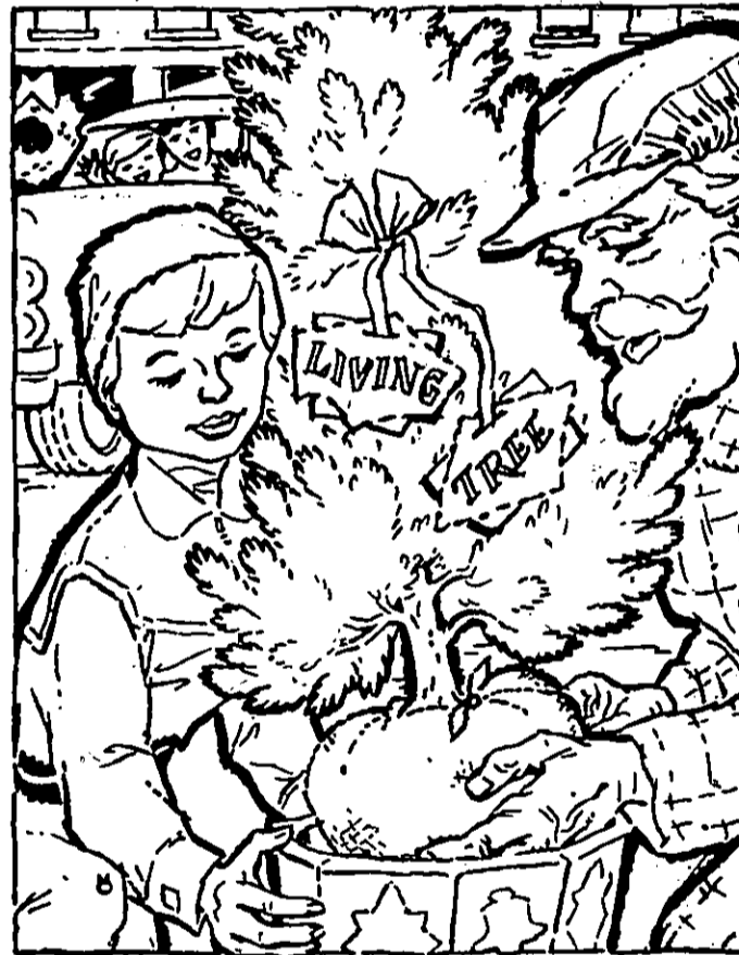
Here's a grand sight to see . . . For Christmas, a real living tree!