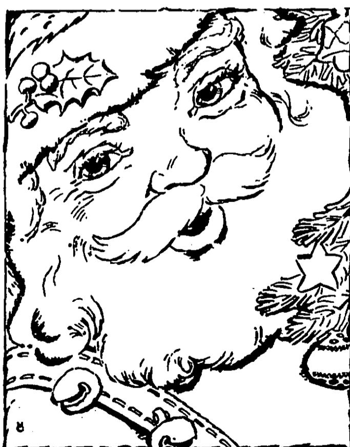
Hurray, hurray! Santa is here To spread lots of holiday cheer!