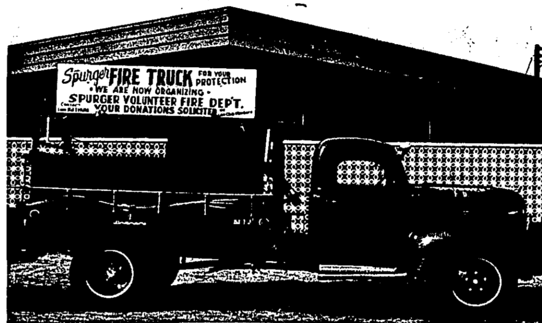
SPURGER'S NEW FIRE TRUCK —Pictured above is the fire truck recently purchased by the Spurger Lions Club for which funds are now being raised. A barbecue, basketball games and dedication of the school cafetorium will be held Saturday with funds going toward the cost of the truck.