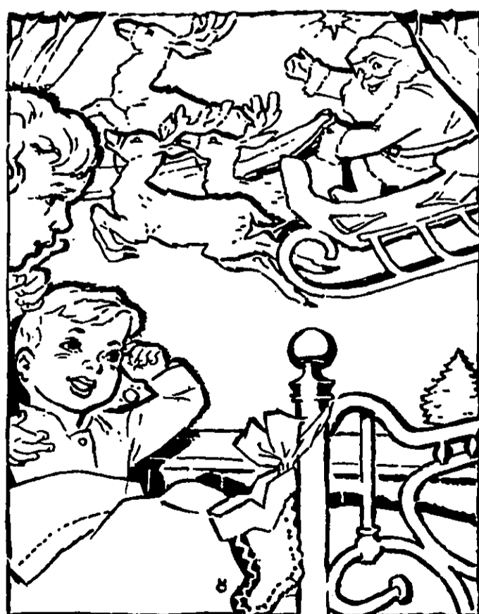
If you're awake and very quick You may catch sight of old St. Nick!