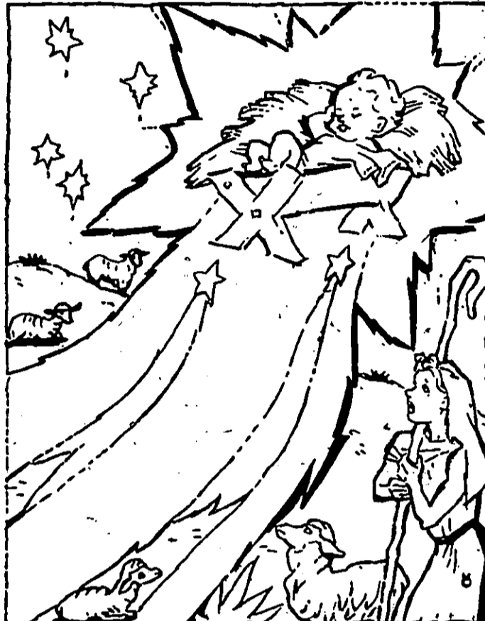
A star shined, Holy and bright, To herald the first Christmas Night.