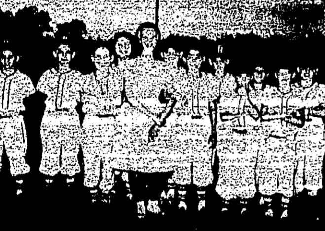
THE ALL STARS

The 1964 season in Tyler County has been 1.42 inches wetter than last year. The weather bureau reported that the total rainfall for the season was 54.58 inches, compared to 53.16 inches in 1963.