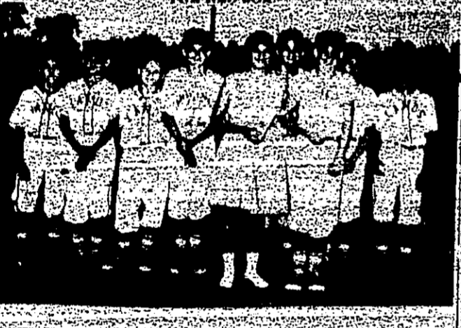
THE ROTARY CLUB