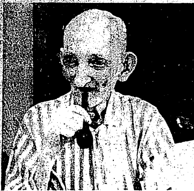
UNCLE JIMMY DICKENS