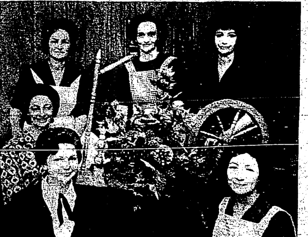
Preparing For Tasting Bee