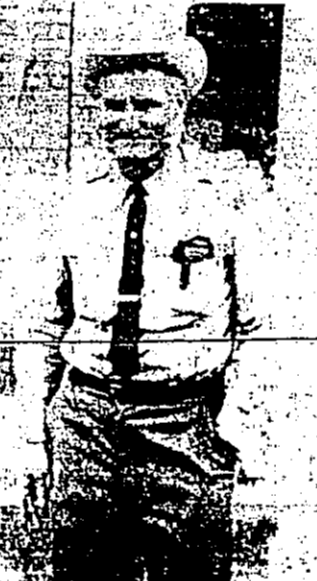
POLICE CHIEF JOHN GRAMMER

Tyler County voters in the special amendment election Tuesday favored only four of the proposals. They were No. 3, providing medical assistance and other benefits to the aged and needy; No. 5, revising teacher retirement provisions; No. 2, authorizing the legislature to provide loans to students at institutions of higher learning; and No. 8, providing for the retention and removal of judges. The vote on each amendment was as follows: No. 1 369 No. 2 321 No. 3 468 No. 4 214 No. 5 414 No. 6 367 No. 7 244 No. 8 357 No. 9 102 No. 10 132