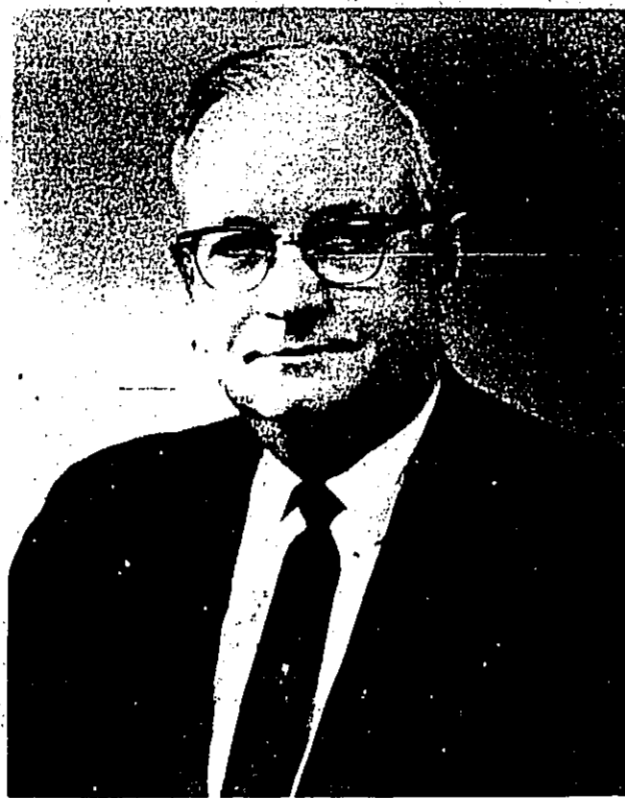
Congressman John Dowdy