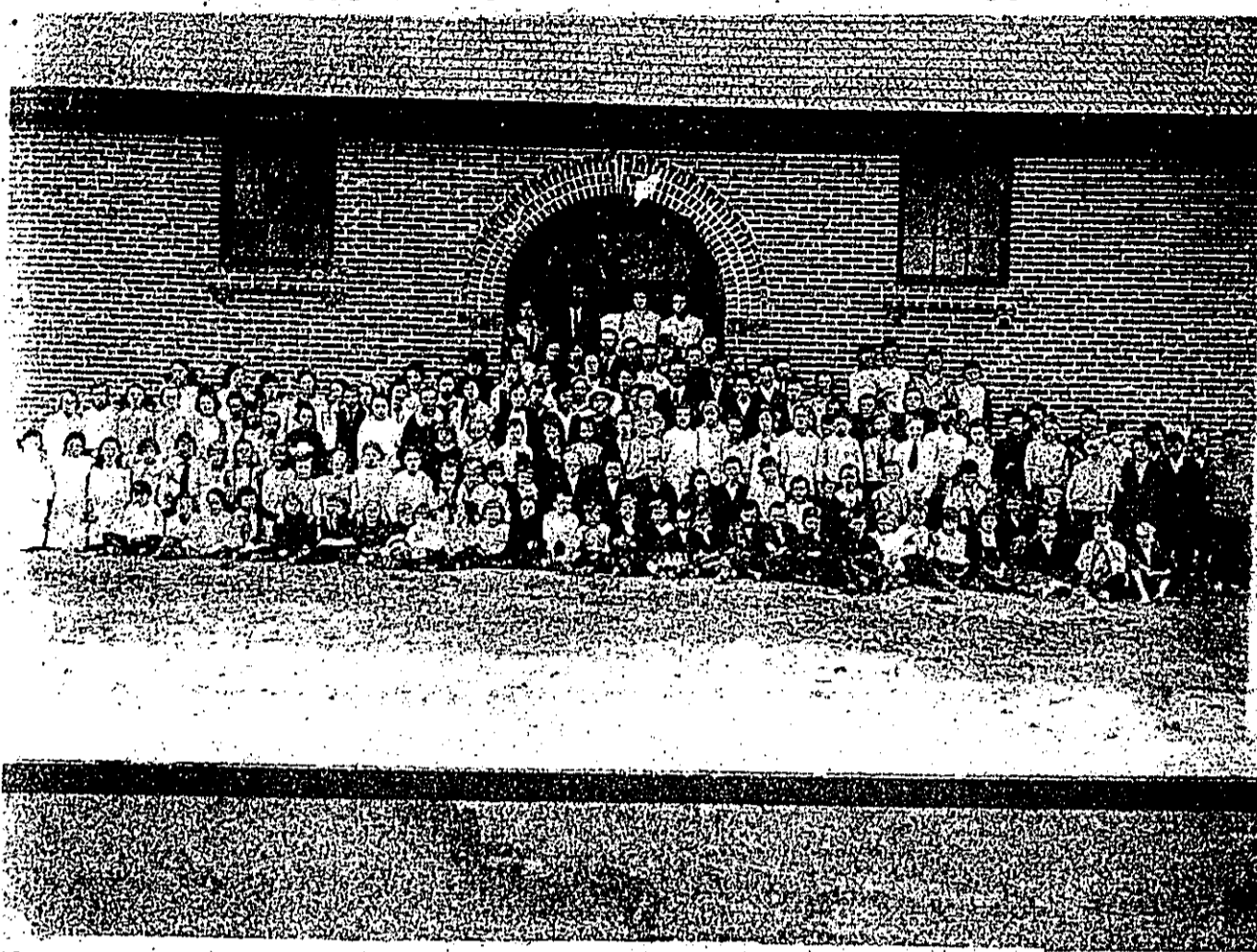
DOUCETTE SCHOOL AND PUPILS 50 YEARS AGO