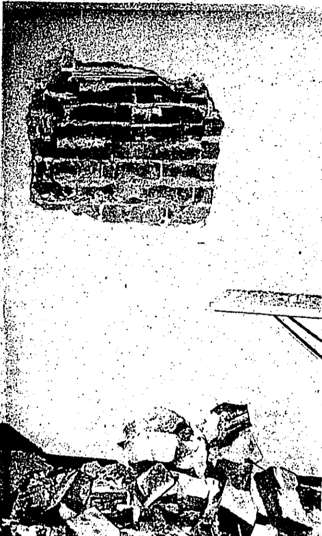
Burglars try to dig through wall of vault.

Burglars broke into the Chester State Bank Wednesday night of last week, worked hard to get into the vault but failed, and left with empty hands except for three silver certificates and an old 45 calibre revolver.