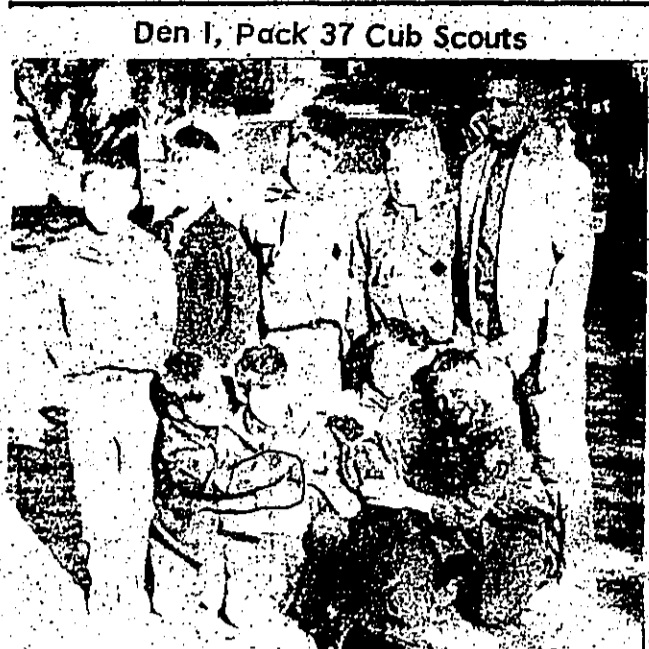
Den 1, Pack 37 Cub Scouts