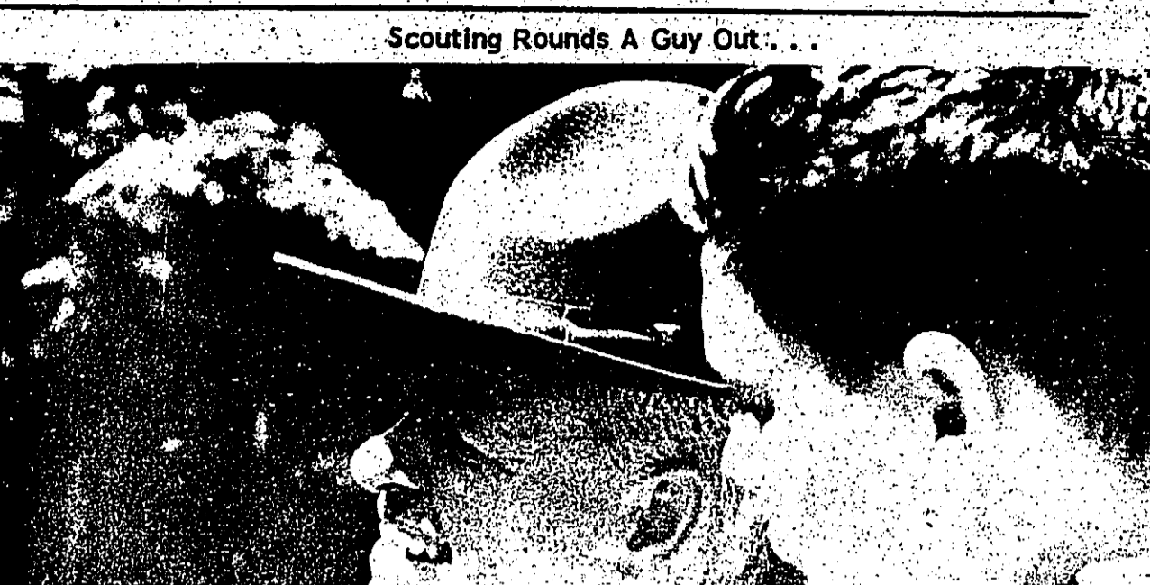
Scouting Rounds A Guy Out...