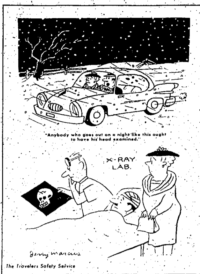
Four out of five personal injury accidents occur on dry roads in clear weather.