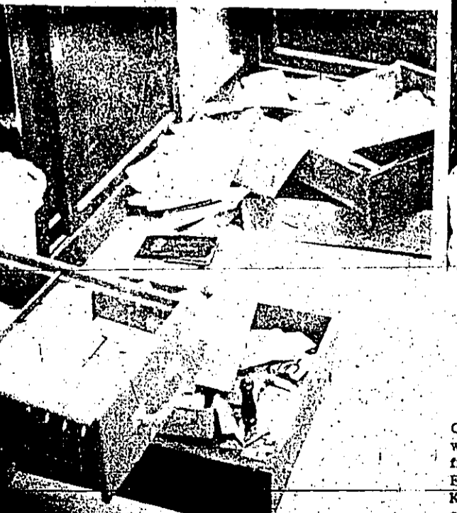
And scatter drawers and papers on floor.