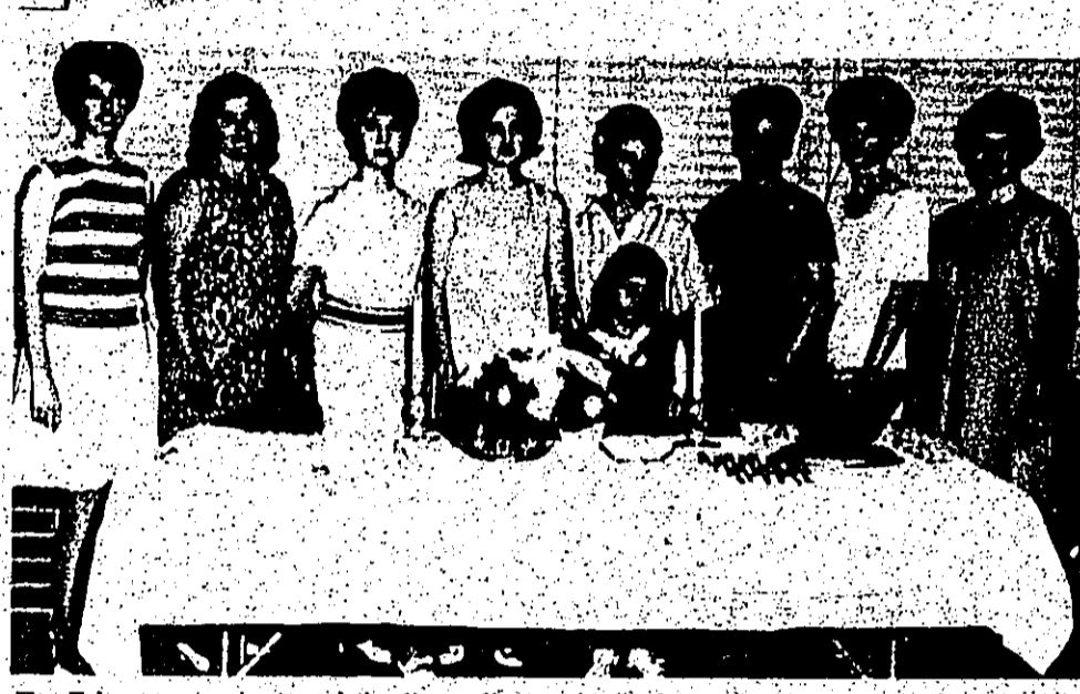
The Tyler county chapter of the Young Homemakers of America honored the young ladies who had served as baby-sitters during the past year at their meeting Monday night in the Wheat Union High Library.