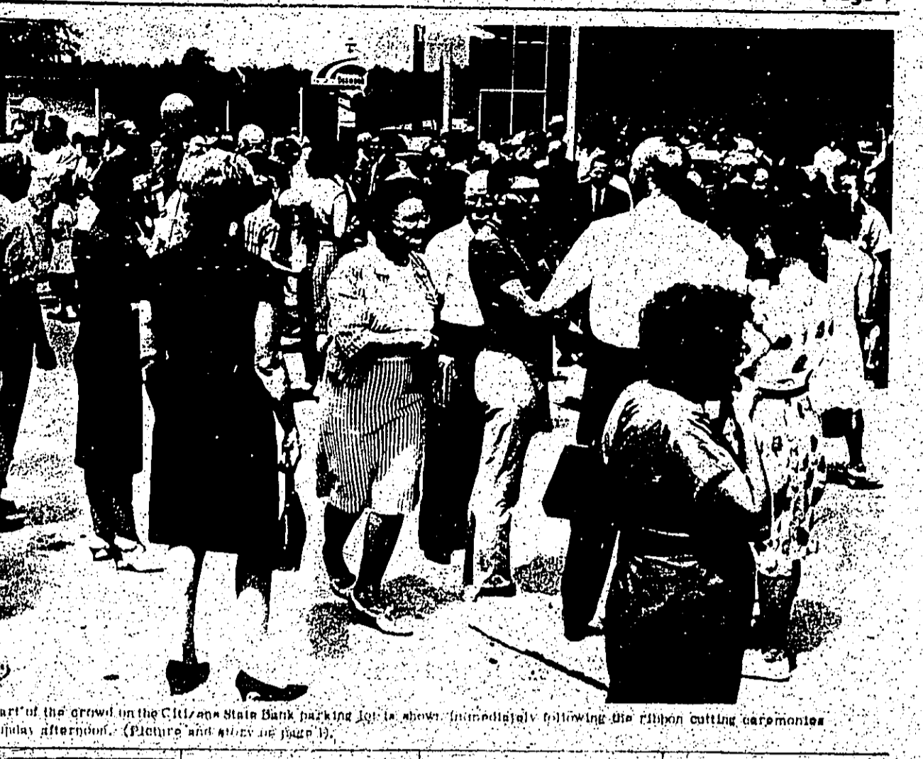
Part of the crowd in the Children's State Bank parking lot in Waco, immediately following the ribbon cutting ceremonies Sunday afternoon.