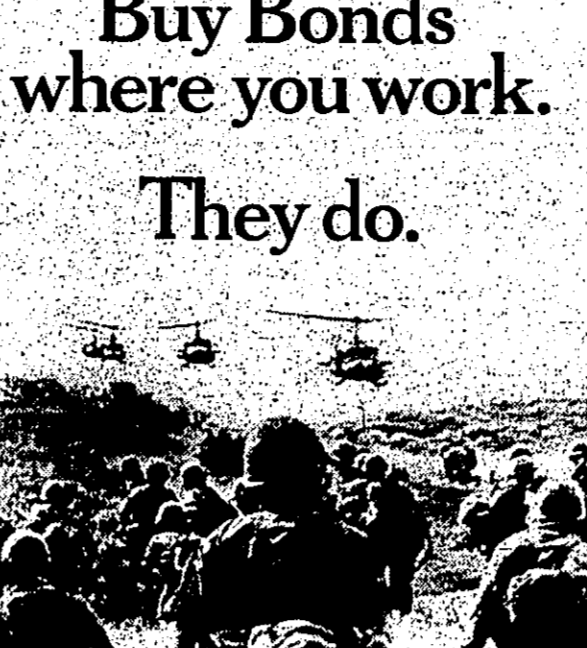
They move out from the landing area and toward their work. It's a tense job. Defending freedom. It takes brave men to do it well. These men are brave — and fearless. A majority of all our servicemen in Vietnam save for the future and support freedom through regular purchase of U.S. Savings Bonds. Should you join them? Buy Savings Bonds where you work or bank.