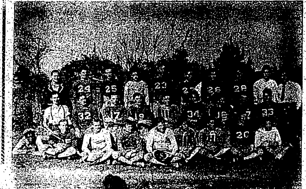
Remember this Woodville football team? It represented Woodville in District 29-B back in the 1934-35 school year and several of those pictured are prominent in county affairs today.