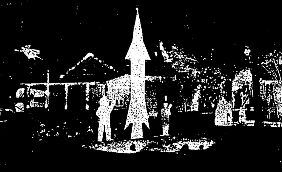
Triple D Guest Ranch near Warren will have its annual open house Sunday from 12 noon until 12 p.m. during which everyone is invited to come and bring the children to see Santa's workshop. The ranch has up its large number of Christmas lights and decorations which annually attract visitors from throughout the area.

Two prisoners escaped from the Tyler County jail Saturday through a bar on a window, bending it down until it snapped in two at a place that had previously been welded and crawled through it. Two prisoners are still at large Tuesday night.