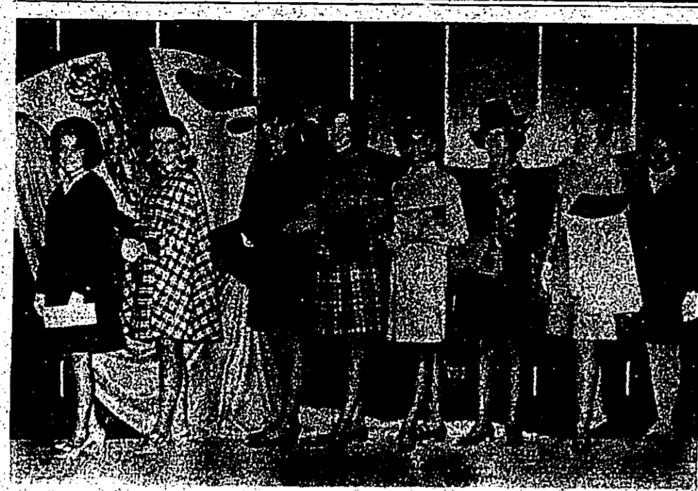
Members of the Women's Page at a recent social event...