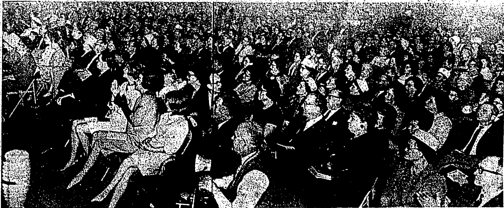
This partial view of the crowd at one of the singing group's sessions shows rapt attention of crowd