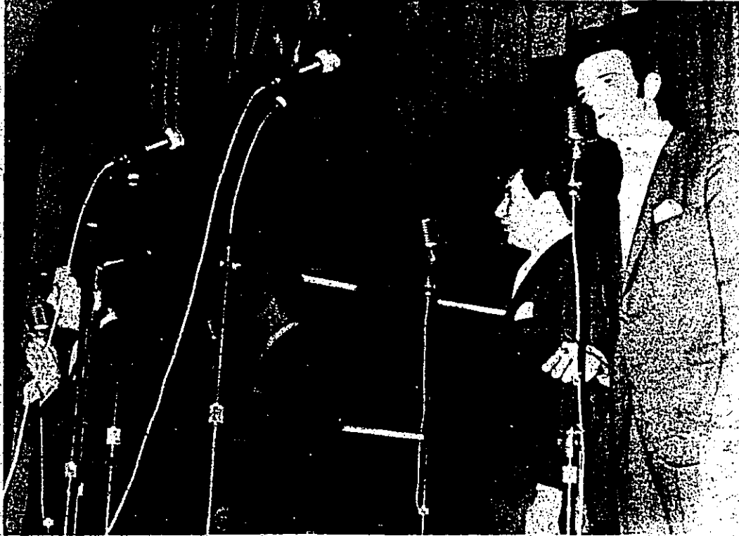
Sons of Calvary was one of the quartets at Tex-La Neches Valley Singing Convention

Quartet Sings Out At Convention Here Sunday