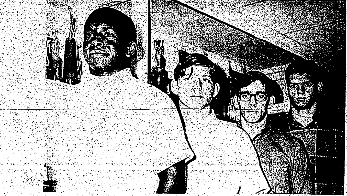
COLMESNEIL ALL DISTRICT SELECTIONS