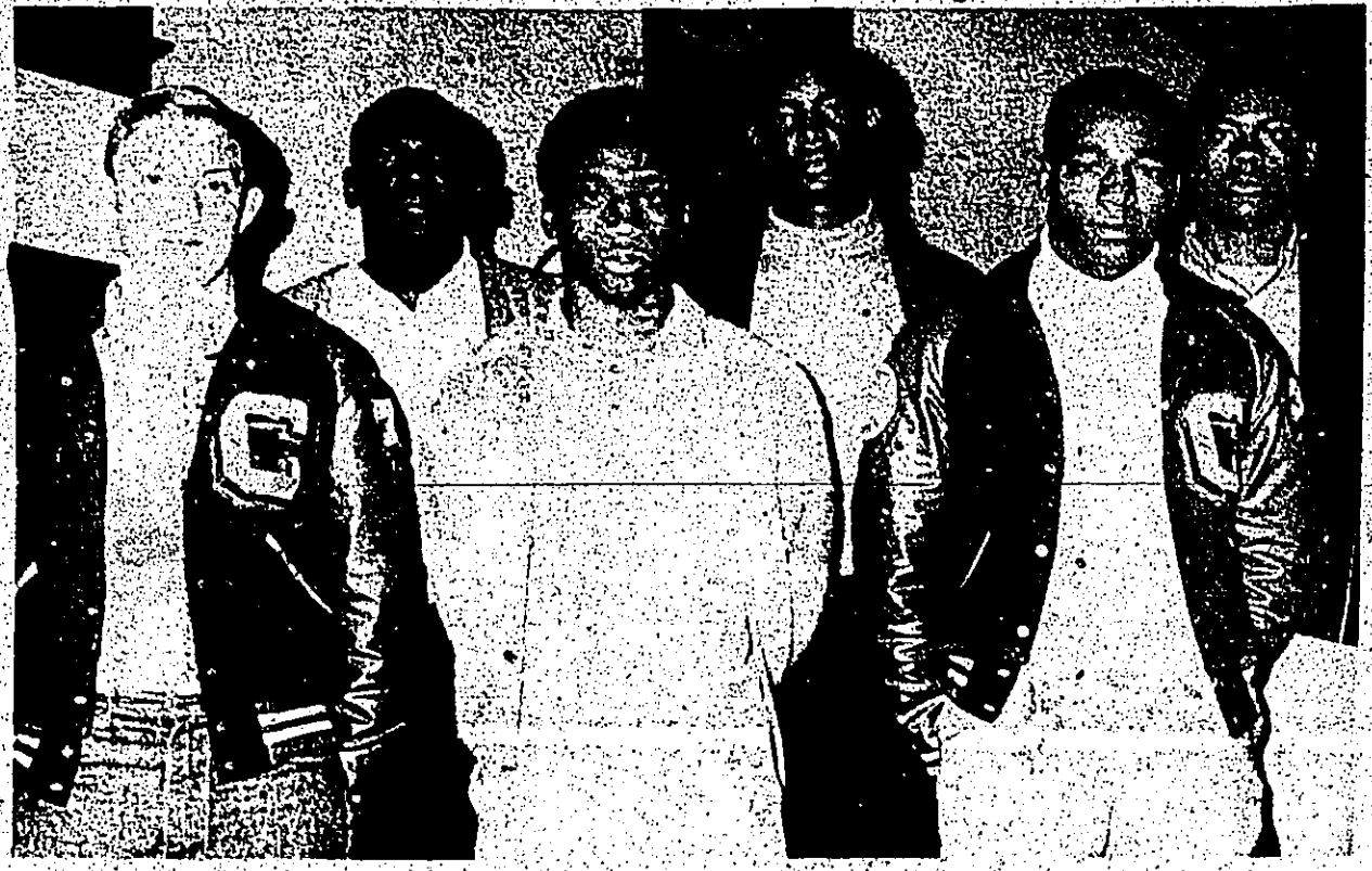
CHESTER ALL DISTRICT SELECTIONS