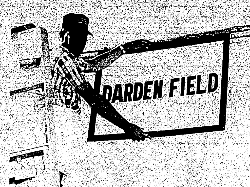
Baseball Field Named After Son-In-Law Of Woodville Couple