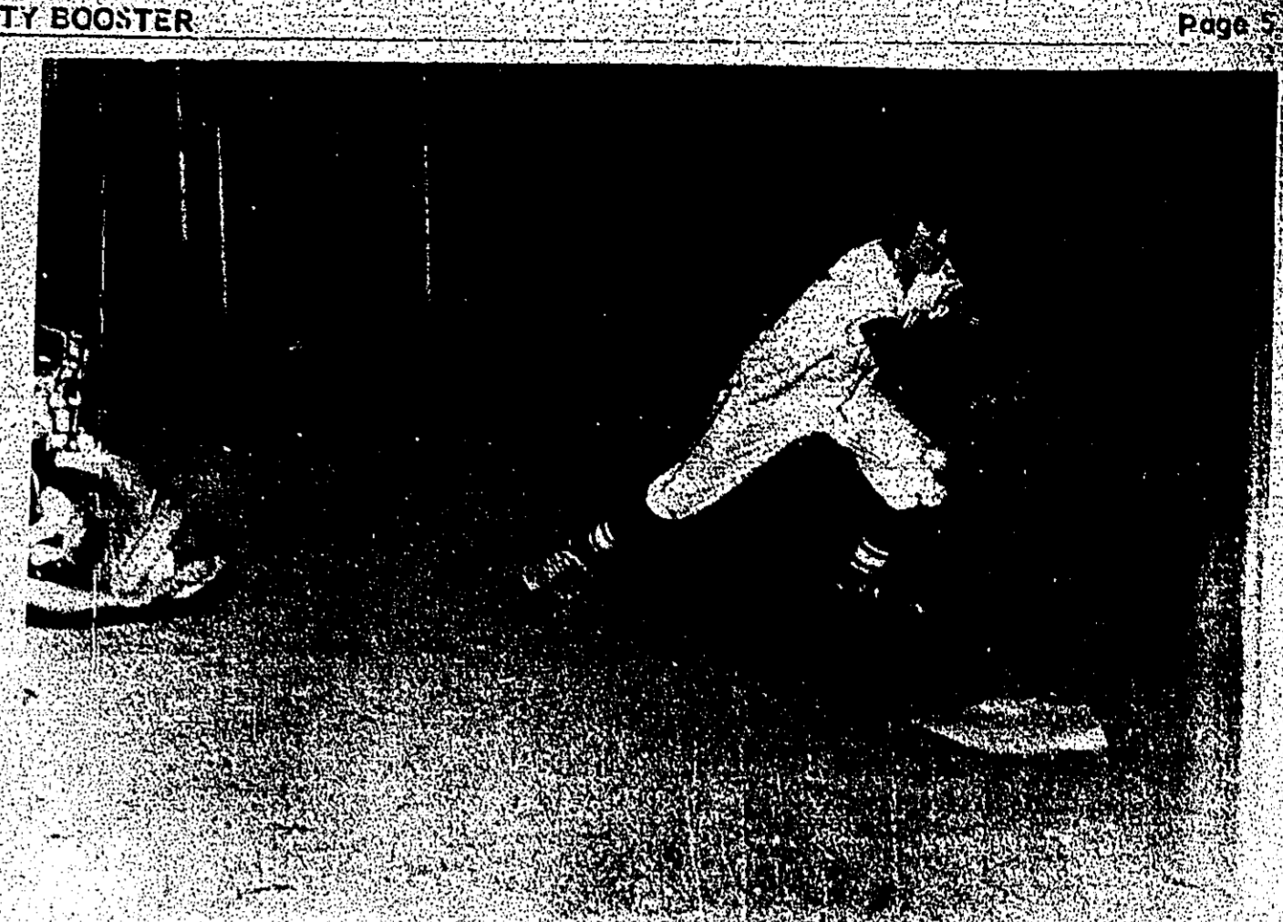
HEY BATTER, THE BALL IS BACK HERE!