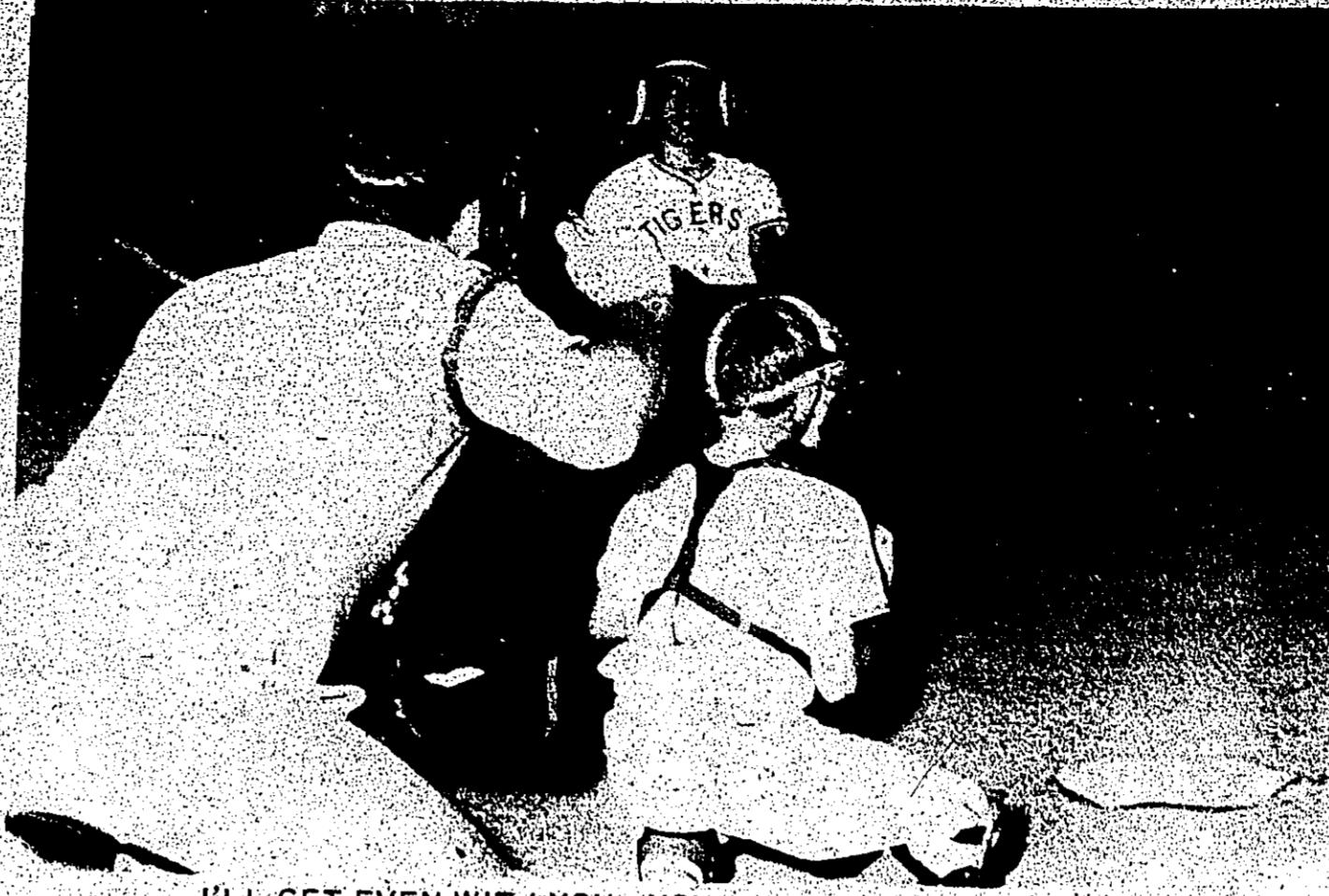
I'LL GET EVEN WITH YOU, YOU BLIND...@%*%&(%$*%$%&# HEY BATTER, THE BALL IS BACK HERE!