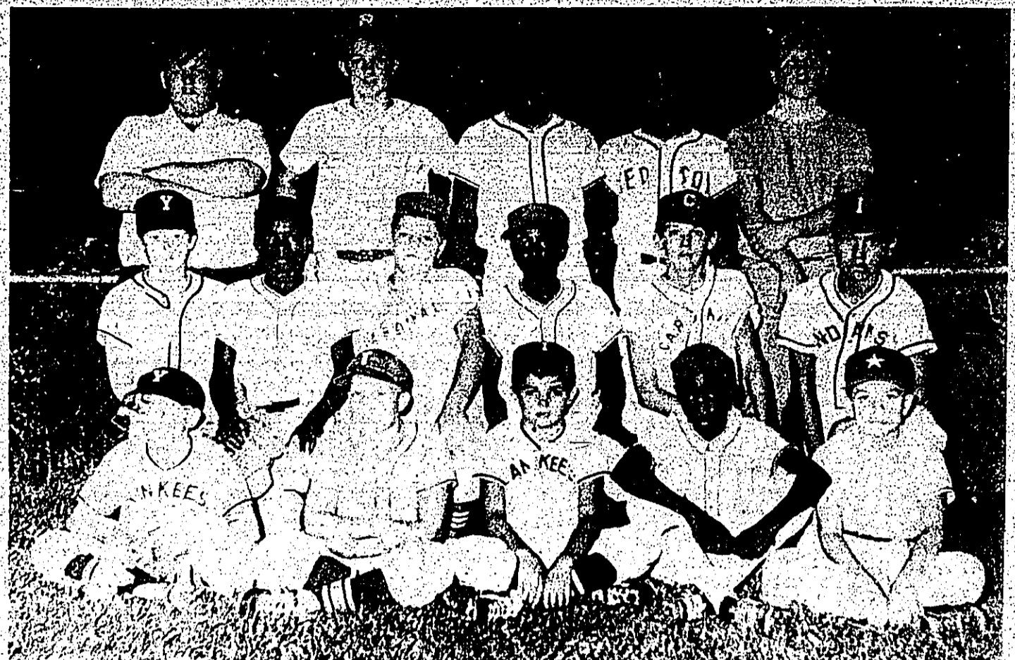
1969 LITTLE LEAGUE ALL STARS