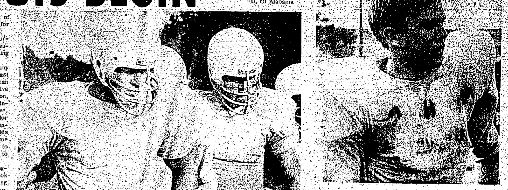
Winning isn't everything, but it sure beats coming in second. Bear Bryant, U. of Alabama

The start of football officially opened last Monday as the Kirby High School Eagles hit the practice field for the opening of the gridiron season.