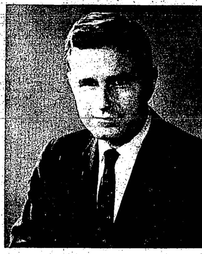
REP. GEORGE BUSH