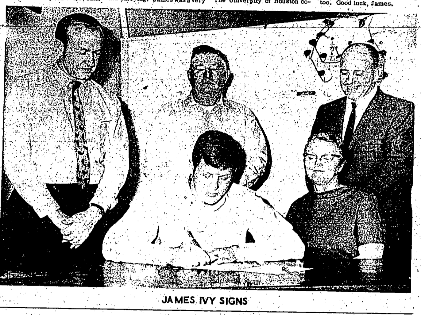
JAMES IVY SIGNS

Fun with Food In Mexico festive occasions are celebrated with a special kind of food. Today you don't have to go to a Mexican restaurant to enjoy Mexican food. You can have it at home. Add some Mexican dishes to your menu.