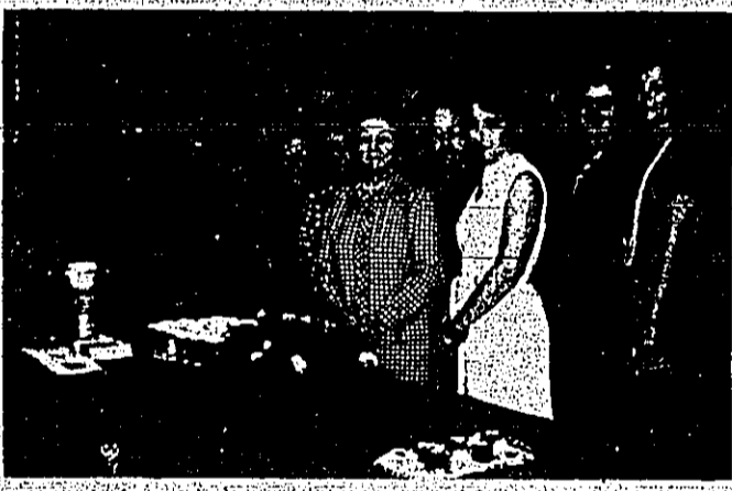
Members of the Women's Study Club.