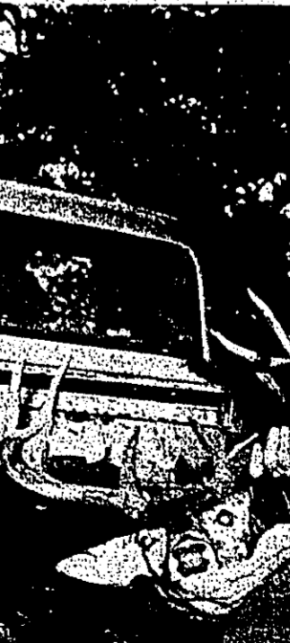
Harold Tawn of Warren, hunting west of that town on the Dallardsville road, came in with this eight point buck. The antlers measured 18-1/2 inches. Also there were two small ones which most hunters would have claimed.