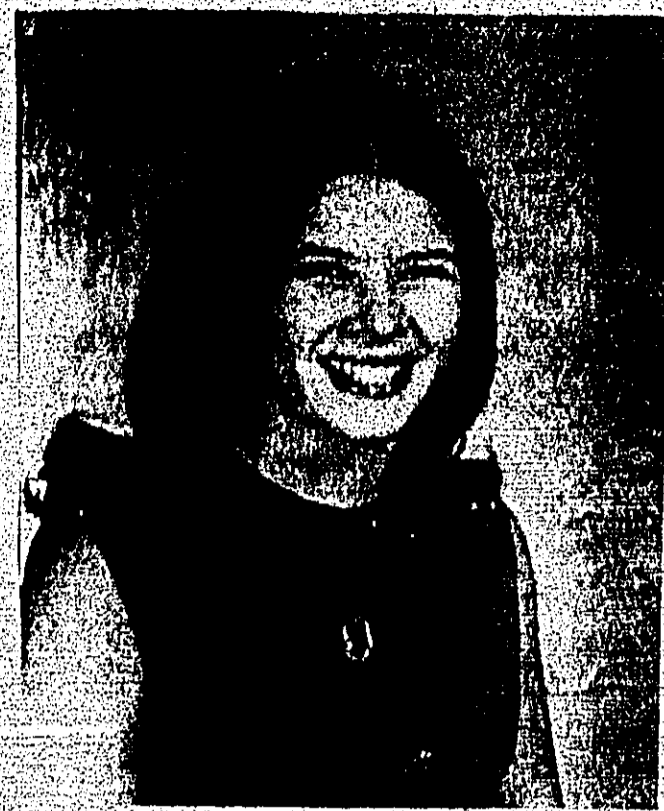
Kirby F.H.A. Chapter Installs Officers For 1972-73