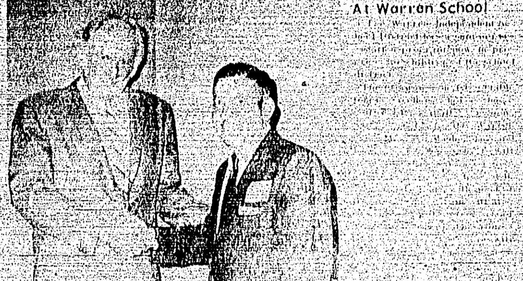
Summer Recreation Program