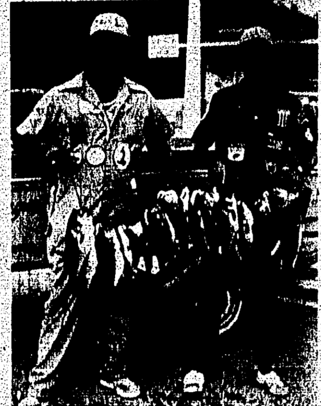
County Delegates from Tyler County...