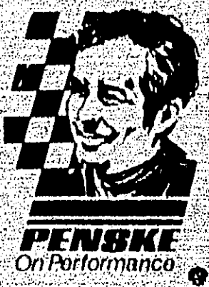
Penske On Performance

Members in Central East Texas are joining together in the formation of a new association dedicated to the conservation of game animals in the area.