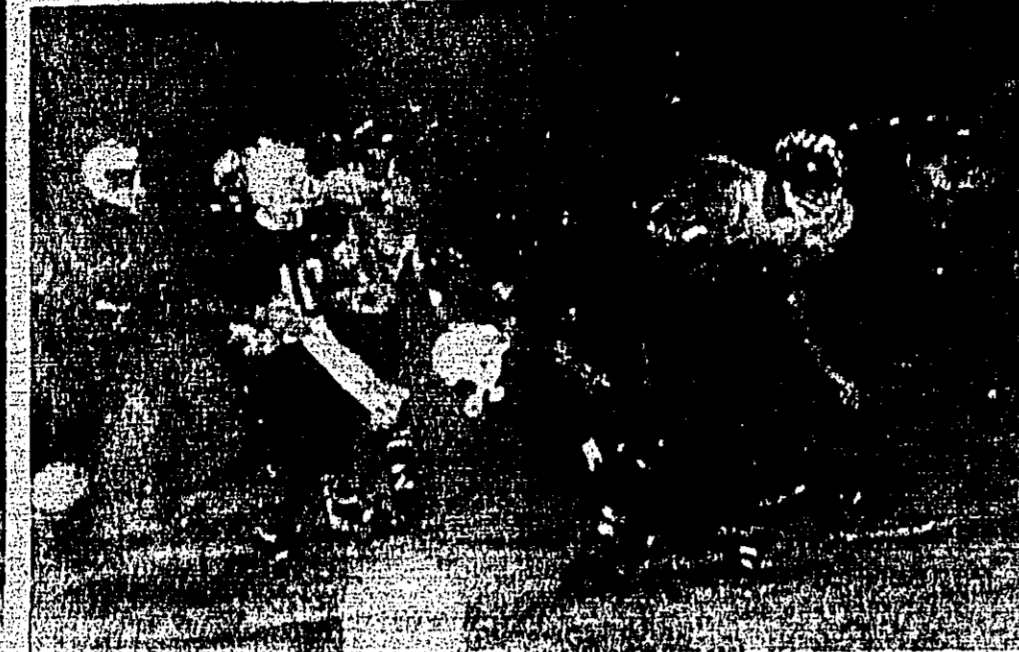
Rain Hurts Chester