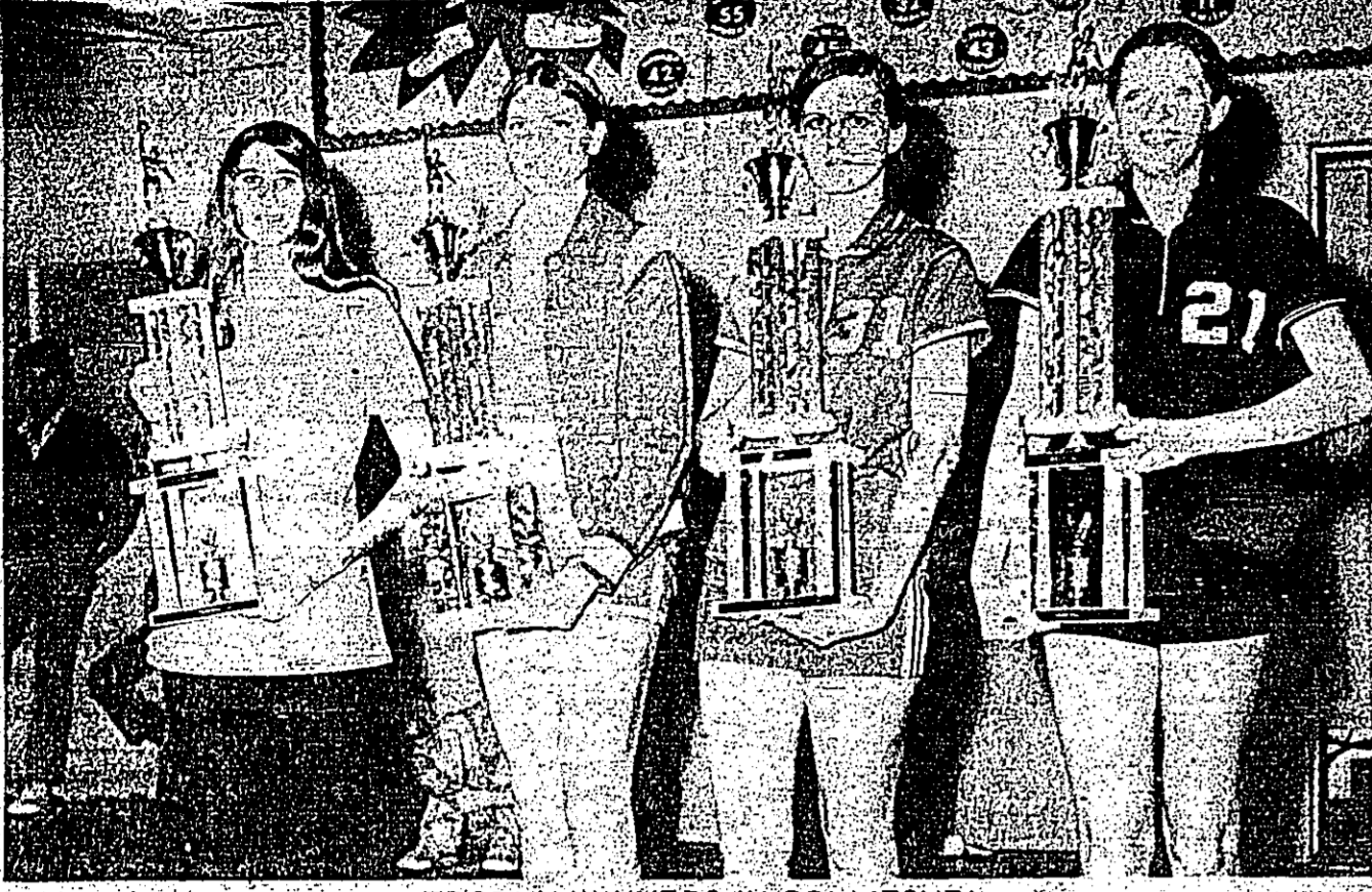
TROPHY WINNERS IN COLMESNEIL. Big Sandy, first; Colmesneil, second; West Orange, third; and Warren, Consolation.