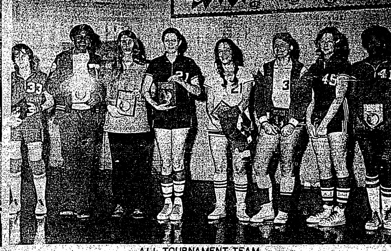
ALL TOURNAMENT TEAM