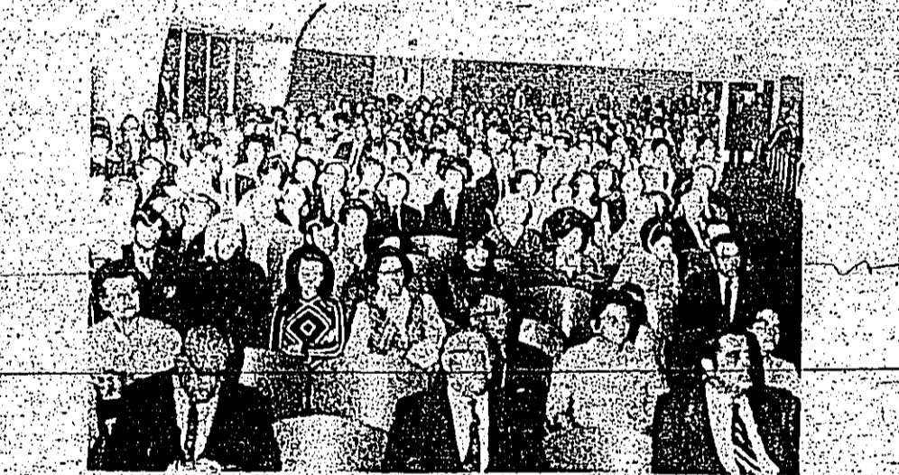
Part of crowd at previous convention

She was very active in Fairview Baptist Church and was very proud of the growth of the church and its building program while she was a member.