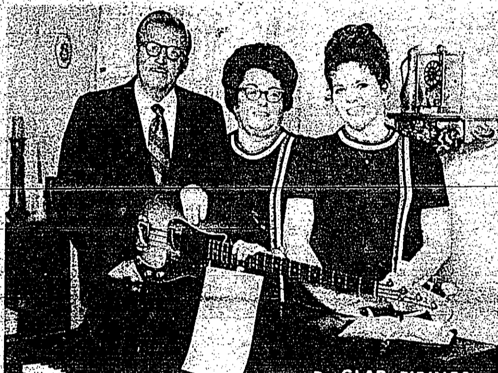
Glad Tidings Trio Will be here again this year

Driving conditions were not expected to improve much until possibly Thursday afternoon. The National Weather Service forecast more sleet or rain Wednesday.