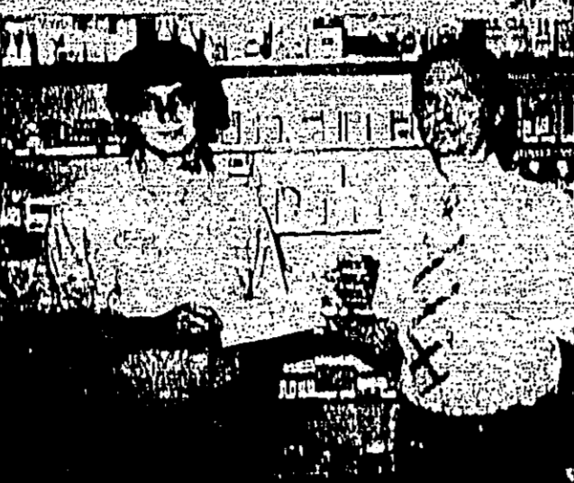
WARREN WARRIORS... (Caption text is partially obscured)

The Warren Warriors... (Main article text describing the game between the Warriors and Colmesneil)