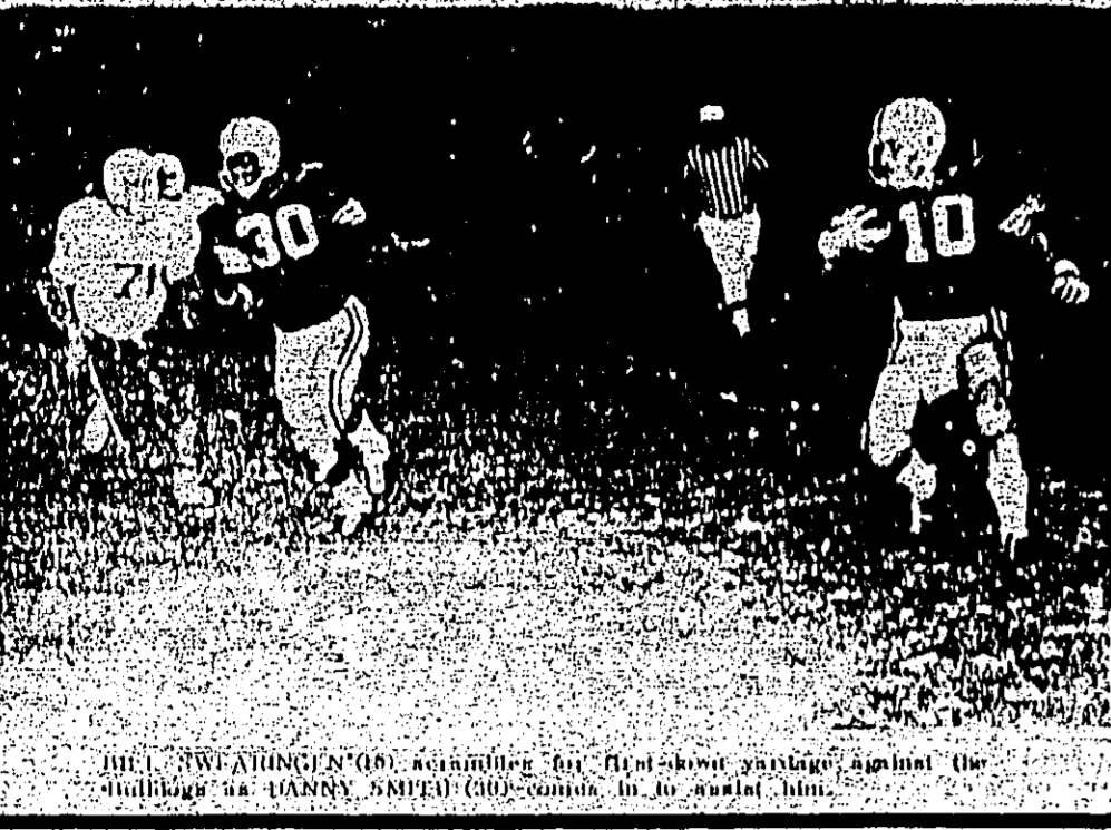
BOILER ROOM ACTION... (Caption text is partially obscured and difficult to read)