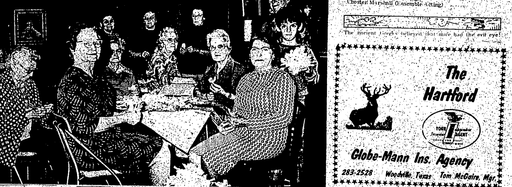
The Student Body's Delightful Day Had The Best Day

Colmesneil Takes Second Place In Speech Sweepstakes Twenty-two students from Colmesneil High School entered the Speech Sweepstakes at Kilgore High School this past Saturday. Colmesneil was one of sixteen schools entered and accumulated the second highest number of points in the eight events to bring home the second place trophy. Colmesneil was one of sixteen schools entered and accumulated the second highest number of points in the eight events to bring home the second place trophy. Colmesneil was one of sixteen schools entered and accumulated the second highest number of points in the eight events to bring home the second place trophy.