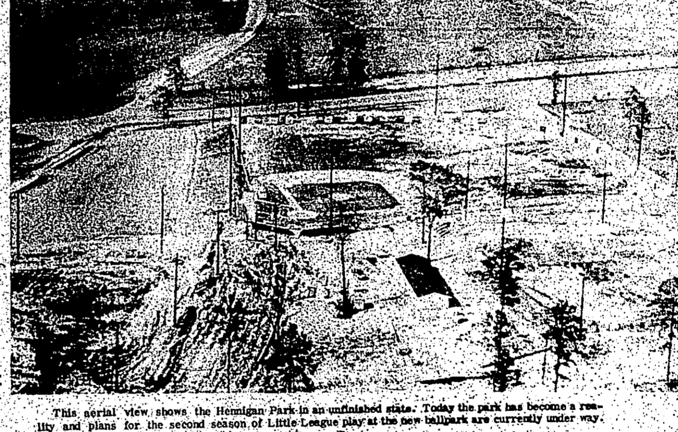
This aerial view shows the Hemigan Park in an unfinished state. Today the park has become a reality and plans for the second season of Little League play at the new ballpark are currently under way.

Members of the Tyler County Little League Association met Tuesday, February 18 and discussed plans for the 1975 ball season. The Little League will consist of teams for boys between the ages of 8-12. Little League play will begin May 5. Each team will play 15 games during the season. The following agenda was set up for the Little League tryouts: 9-10 Years March 24, 25 11-12 Years April 7, 8 8 Years April 9 All tryouts will be held at the old Little League field behind A&M Motor Company. Team Announcements will be made April 14 at the old football field in front of the Kirby High gymnasium. All Little League players must be present to find out on which team they will be playing. Registration will be March 8-March 15 from 9 a.m. until 12 noon at the Canada Gym, at the Woodville Elementary School. All boys who want to play Little League (8-12 Years) or Senior League (13-15 Years) must register at this time. Players should be accompanied by their parents or guardian and bring their birth certificate. There will be a $5.00 registration fee. Boys should also bring the name and policy number of their insurance policy if they have one.