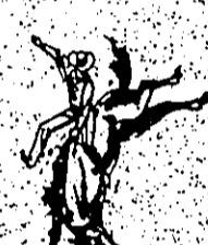
7, 8 and 9 Year Olds In The 1974 Goat Scramble