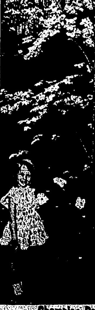
Champion Dogwood Blossoms