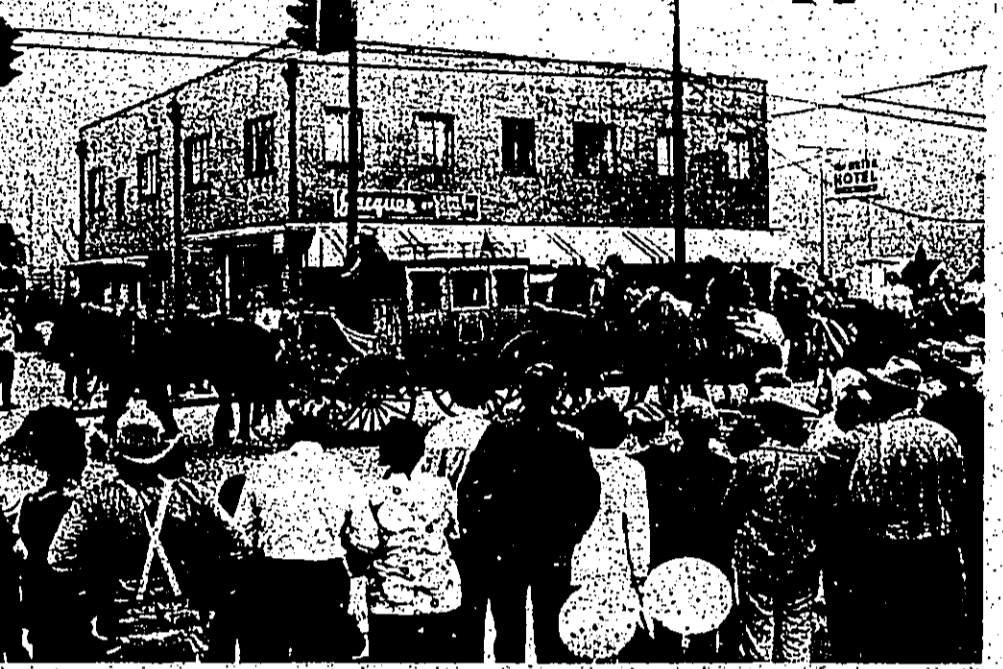
The Parade Passes