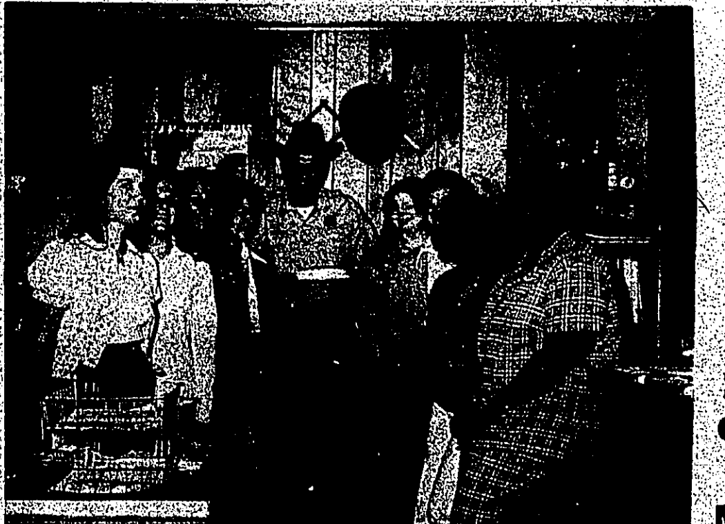
City Police Appreciation Day

The Bethel Baptist Church of Warren will observe its 15th Anniversary, Sunday April 20. Following the morning services, lunch will be served at the church. Bethel Baptist Church was organized April 17, 1960 with 46 charter members. The church first met in a vacant store building. On November 19, 1960 the church moved into its first auditorium. One year later an educational unit with eight classrooms was built. Anniversary Sunday, April 17, 1966 the church dedicated a new auditorium and remodeled the old auditorium into a fellowship hall and additional classrooms. Many things have been added in the fifteen year history of the church—educational unit, new auditorium, organ, pew cushions, drapes and the latest is a recreational court for tennis, basketball and volleyball. Former pastors are Eddie Kerwin, Tomman Patrick, Charles Justice, John Erna Billy Cole and Jim Hughes. The present pastor is John Spahnke. Bethel Baptist Church wishes to extend an invitation to everyone to join us on our 15th Anniversary celebration.