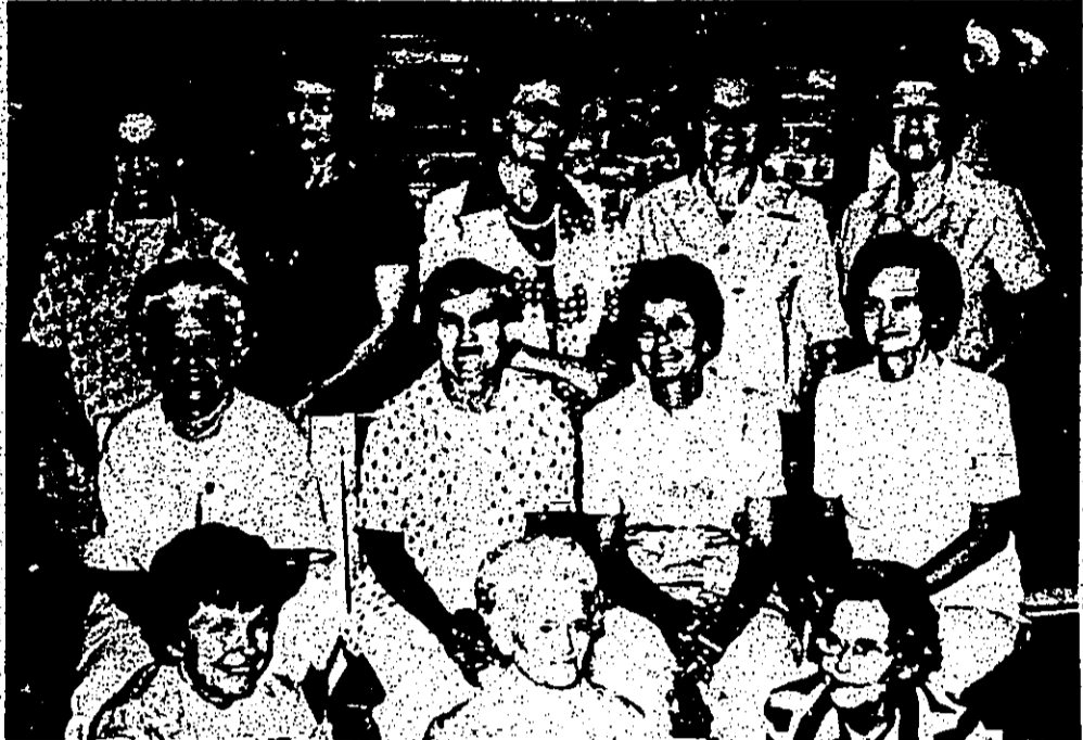
PINK LADY VOLUNTEERS HOLD FIRST MEETING

We'll get the most we can out of the Friday scrimmage," the coach said who brings the team back this year following a previous 1-9 record.