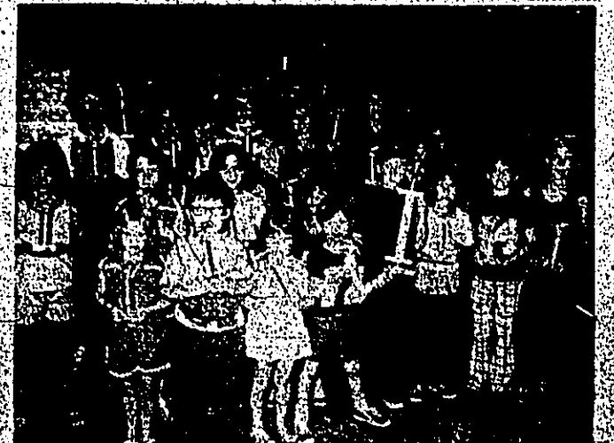
Entrants in Father, Son and Daughter Bass Club fishing tournament.