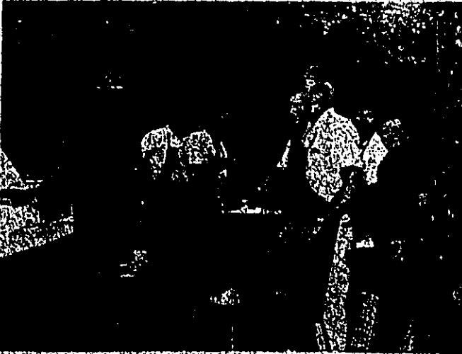
Cooks for the Woodville Bass Club fish fry.