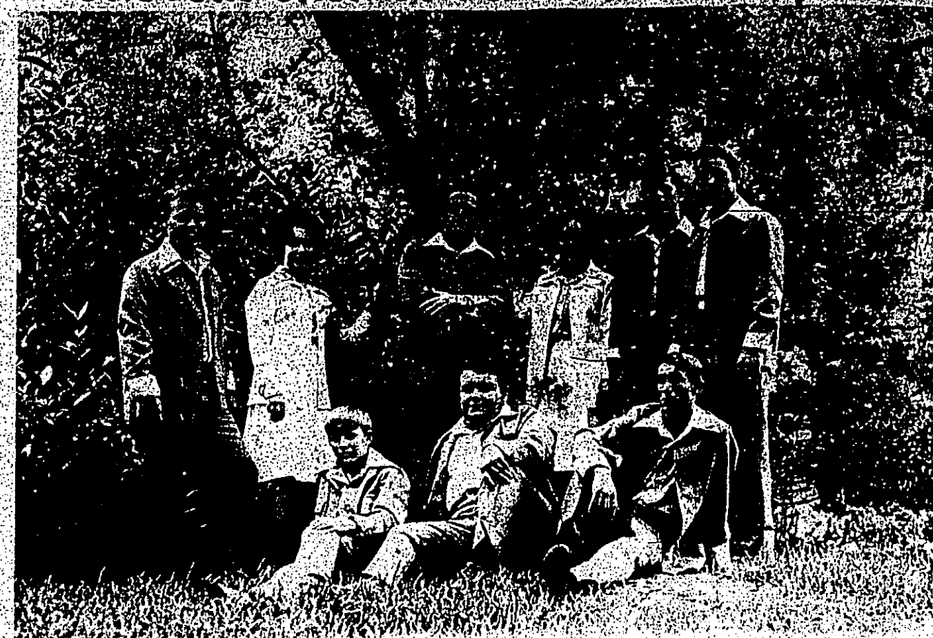
The End Time Voices of Vidor, Texas, sang at the Apostolic Tabernacle United Pentecostal Church last Sunday, and because they were so popular, they have been asked to return and perform Friday night, September 13 at 7:30 o'clock. The public is invited. No admission will be charged.