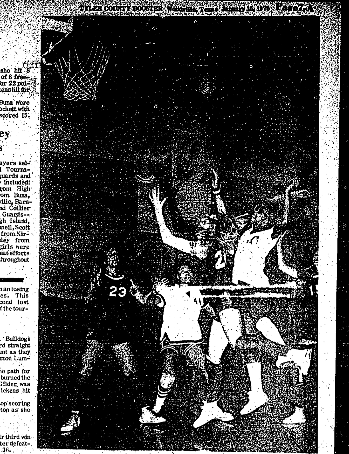
WOODVILLE VS. HIGH ISLAND ACTION