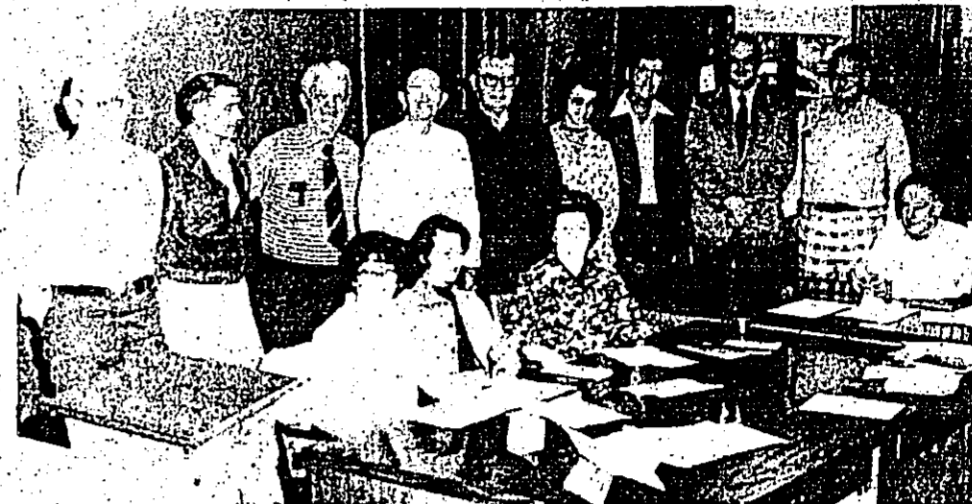
Fair Board Members Meet On Monday